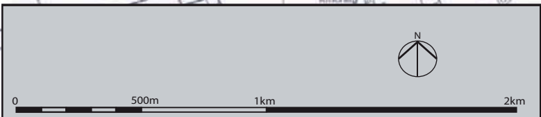
Figure A-4: Existing Walking and Cycling Infrastructure in Invergordon