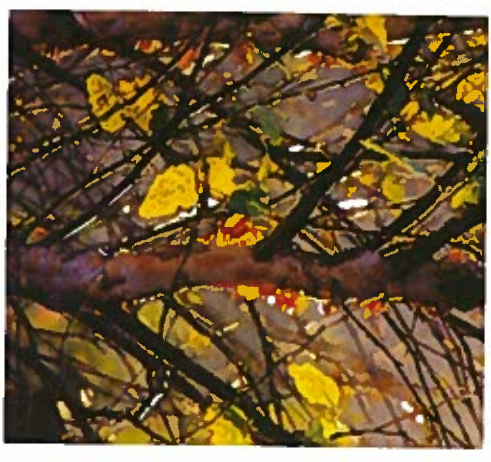
Birch trees in autumn sunlight

"It looks as if it had been let down from heaven by the four corners to be the residence of a Chief".