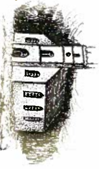
Duirinish Parish Church