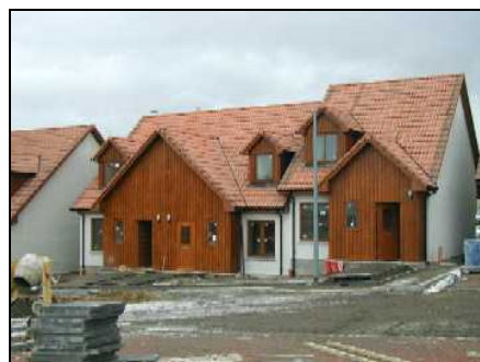
2 bedroom Strathnairn houses at Woodside Park