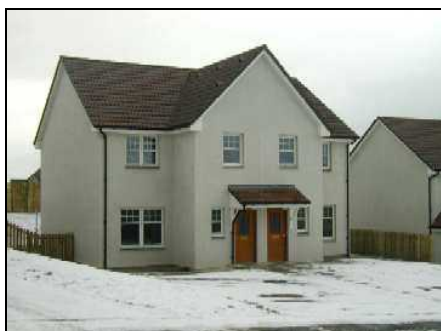
3 bedroom MacKintosh Highland houses at Westfield Way

The houses were targeted at first time buyers who were Council or housing association tenants, and those on their waiting lists. MacKintosh Highland sold 6 three bedroom houses at the price of £87,500 and 6 two bedroom houses at £82,000. Strathnairn Ltd sold 14 two bedroom houses for £82,000 each. There was a huge response to the adverts inviting interest from those eligible to apply and these schemes have given people an opportunity to own their own homes in Inverness at a reasonable price, with many of the purchasers moving in during March.