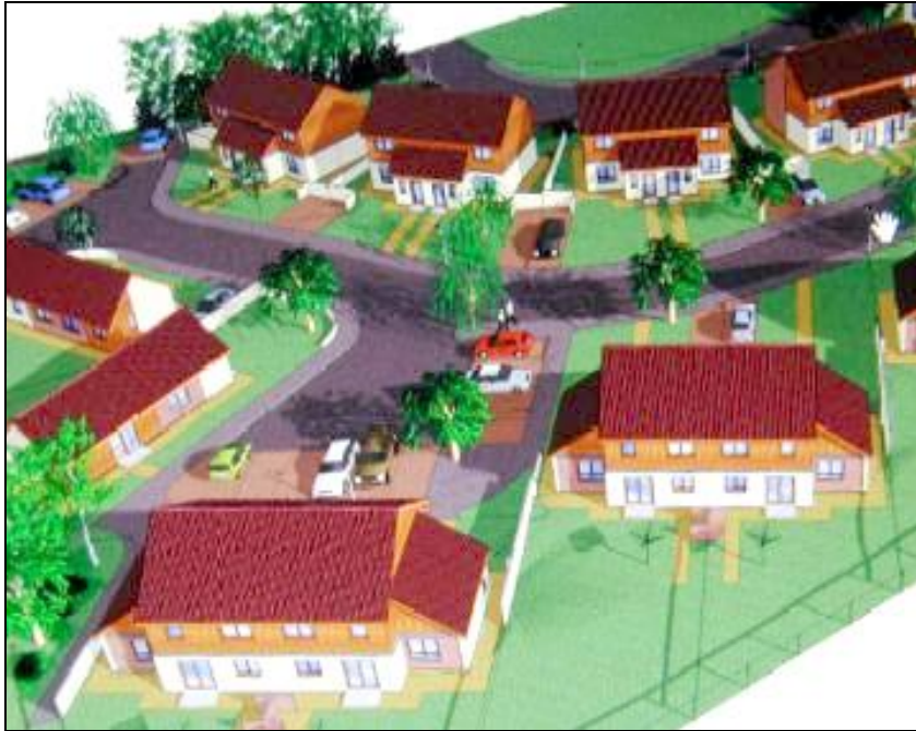
An architect's impression of the new development at the former allotment site, Thurso (courtesy of 'Pentarq')

Discussion at the Caithness Area Housing Development Forum identified this area of Council owned land as having potential for housing development. The Council was able to identify alternative allotments for the tenants who were using the site, releasing the land which will be developed by Pentland Housing Association, commencing on site in April of this year. The development will provide a total of 22 new affordable homes, comprising 2 two bedroom wheelchair accessible bungalows, 8 two bedroom houses, 6 three bedroom houses and 6 four bedroom houses. Six of the completed properties will be available for affordable home ownership under the Homestake initiative with the remaining sixteen being for affordable rent.