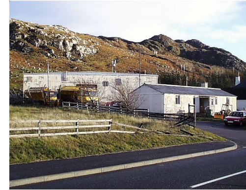
Above: Roads Depot

6.3 Gairloch is a fully digital telephone exchange that can support all digital services with the exception of ADSL. BT will provide a fibre cable at no cost should it be required. If development of the site involves significant telecommunications e.g. a Call Centre, then additional network build to a second exchange may be required.