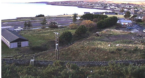
Above: Site viewed from the west