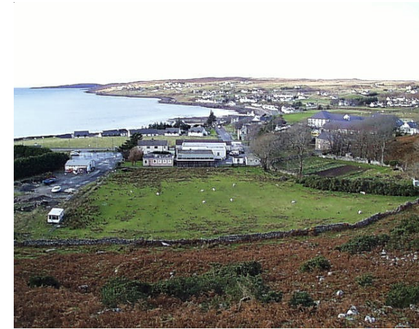
Above: Housing Site