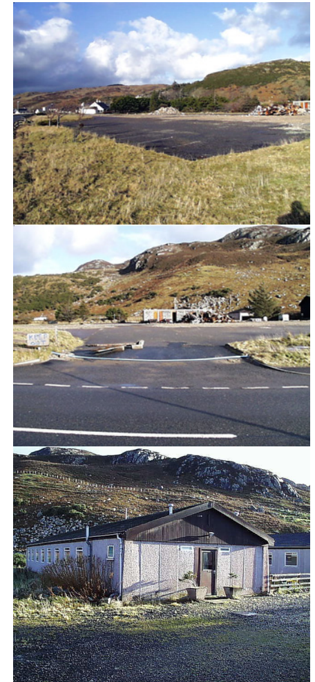
Top: Site of former Gairloch Sands Hotel Middle: Entrance to the Site Bottom: Former staff quarters

5.18 There are a number of clumps of Japanese Knotweed and several Rhododendron bushes within the site. These should be uprooted and any re-growth sprayed. The advice of Scottish Natural Heritage should be sought on the disposal of soil and roots.