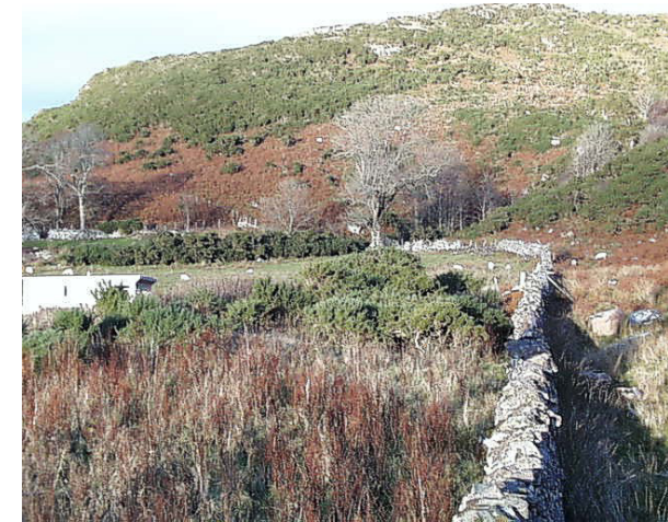
Above: Housing site showing stone dyke and specimen trees

5.13 The main central watercourse should become the core of an open space that both links and divides the housing site from the more commercial development. The current width of 7m should be considered a minimum. Where possible, steeper sides should be eased out to a more natural form. Existing vegetation should be retained and incorporated as part of the open space design with the exception of the conifers at the car park end. These do provide shelter however and it would be appropriate to plant native species (such as hazel, willow and rowan) in the lee with conifers being removed after the new planting is established. Most existing trees along the northern boundary are fairly mature and replacement planting should be incorporated into any proposals.