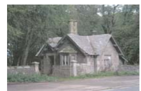
What would be really fun to have in your community or in the Highlands