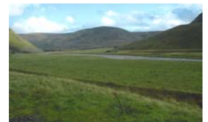
What you're not so keen on in your community