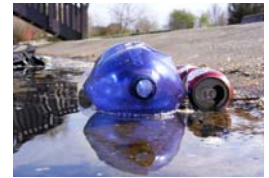
What could be improved in your community