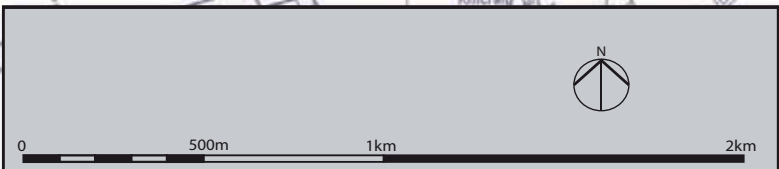
Figure A-2: Reported Accidents in Invergordon (2005-2009)