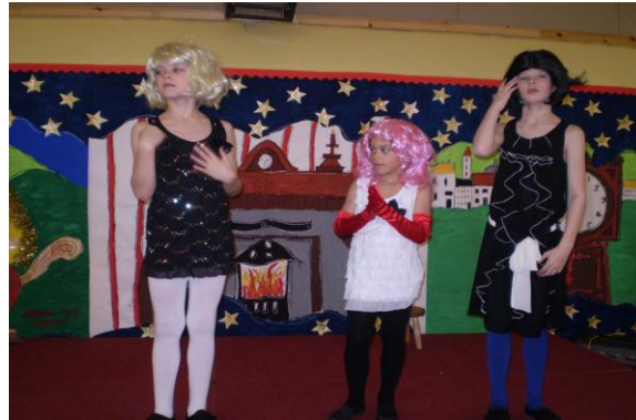
Cinderella December 2011

Children are given opportunities to act and mime throughout the session, with greater frequency in the Infant Classes where role-play etc. is all part of their experiences. The whole School is usually involved in a play, pantomime or musical production at Christmas time for parents and friends of the School. In addition we sometimes have visits from outreach workers and visiting performers at various times throughout the year. We also visit the theatre in Inverness on an annual basis and attend local performances from drama groups when appropriate.