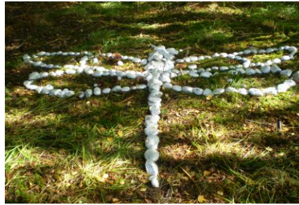
A visual arts project with local artists – displayed at SNH Beinn Eighe Visitor Centre

The school has achieved its second Eco-Schools Green Flag and is working towards achieving its third flag.