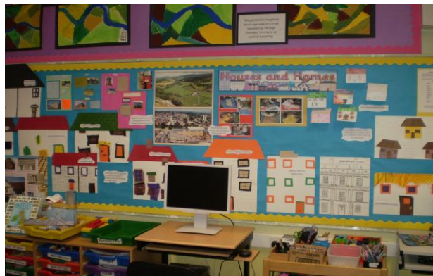
Part of a display about homes and Houses

Expressive Arts incorporates the subjects of Music, Drama, Physical Education and Art.