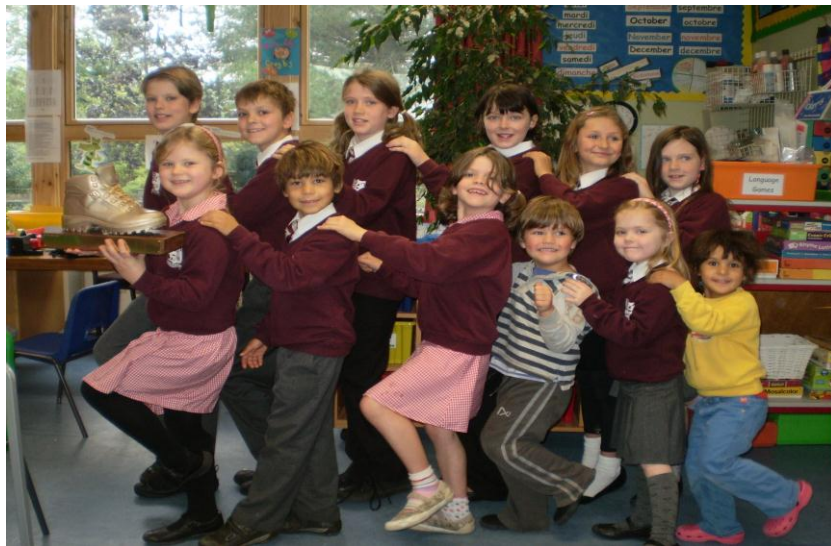
Winning the Golden Boot Award for Walk to School Week

The school organises a Healthy Highland Week each summer when a range of activities are enjoyed by pupils and parents alike. Children have the opportunity to participate in overnight adventurous activities during the course of their primary education. Recently these stays have been centred in the Cairngorms.