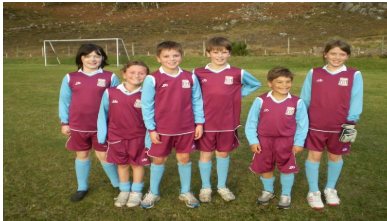
Wearing our new football kit at a match against Shildaig!

Children are encouraged to participate in Inter-School Sporting events and festivals, organised locally within the Gairloch Cluster and by the Ross Primary Sports Association. The school works closely with the Active Schools Co-ordinator and seeks to provide opportunities for personal achievement.