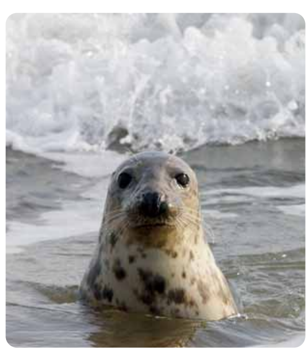
Grey seal