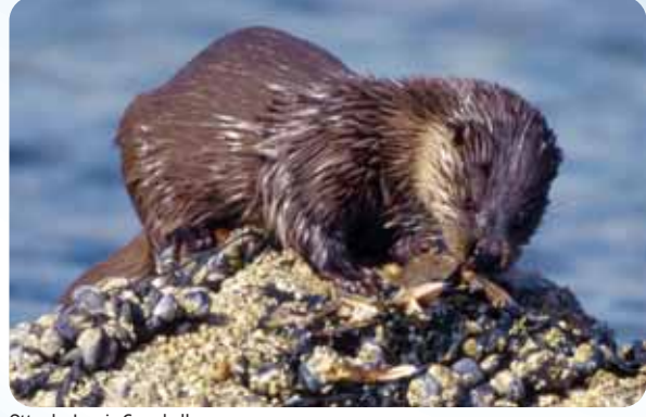
Otter by Laurie Campbell

Otters are beautiful creatures which are semi aquatic, and don't live in the water all the time