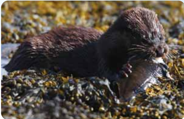
Otter and fish

Otters are semi aquatic, and don't live in the water all the time