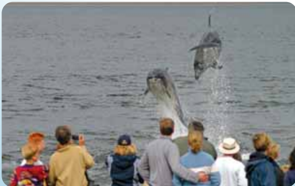
Dolphin watching at Chanonry Point

If you're lucky enough to see dolphins play, I'm sure you'll marvel at their sheer exuberance!