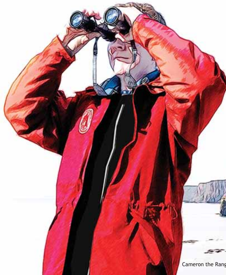
Cameron the Ranger ©

North Kessock and Chanonry Point are two important locations, not only for viewing the Moray Firth's resident population of dolphins, whose acrobatic antics are a joy to behold, but also for seals, porpoises and other coastal wildlife.