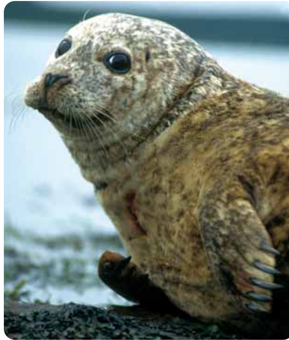
Common seal by Ken Crossan from The Caithness Collection