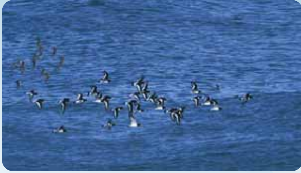
Oystercatchers and Sanderlings in flight

Keep an eye out for flocks of birds, they might not be the only ones looking for fish