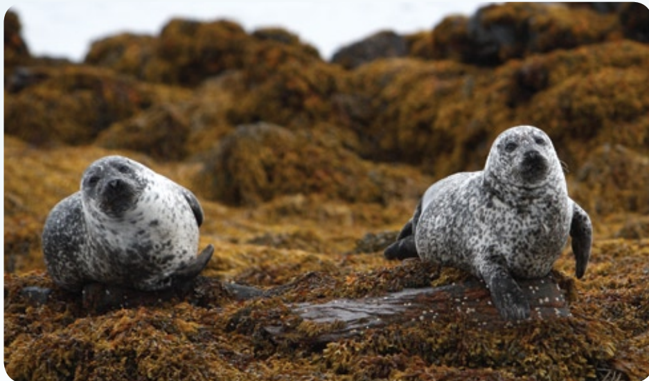
Common seals, Dunvegan

This booklet will guide you around the trail by recommending the best sites for viewing, although marine wildlife can be seen all around the coast. It also gives advice on identifying what you have seen and useful contact numbers for you to report any sightings.