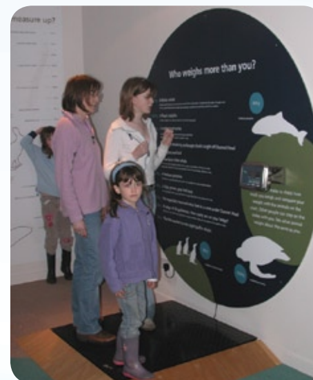
Seadrift Visitor Centre, Dunnet by The Highland Council

Gairloch Marine Life Centre, Wester Ross Tel: 01445 712636. WDCS Dolphin and Seal Centre, North Kessock near Inverness Tel: 01249 449500. WDCS Wildlife Centre, Spey Bay near Elgin Tel: 01343 820339. Seadrift Visitor Centre, Dunnet Tel: 01847 821531.