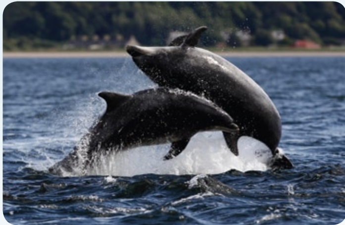
Bottlenose dolphins

Wear warm, waterproof clothing: you are on the same latitude as Alaska. Also bring sunscreen to protect you from the summer sun's strong rays. Pack food and drink as the nearest shop or café may be over ten miles away.