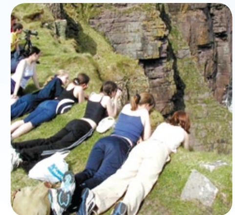
Looking for wildlife, Handa.

For training in cetacean watching and identification or for more information about shore-based monitoring in Scotland, contact the Whale and Dolphin Conservation Society. (WDCS) Tel: 01343 820339, or e-mail shorewatch@wdcs.org , or visit www.wdcs.org/shorewatch .