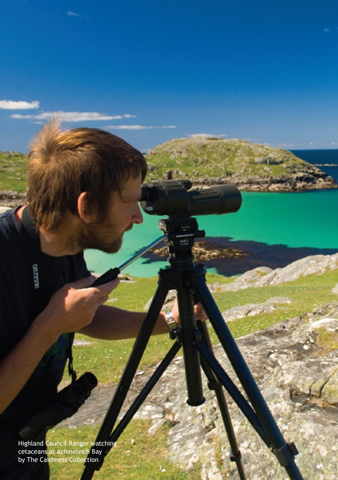
Highland Council Ranger watching cetaceans at Achmelvich Bay