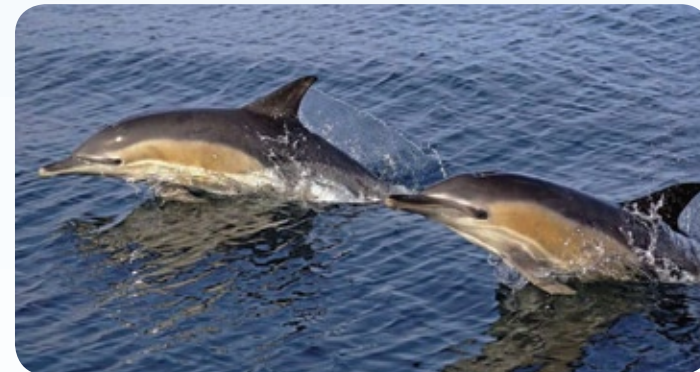
Common dolphins

For further information see www.marinecode.org