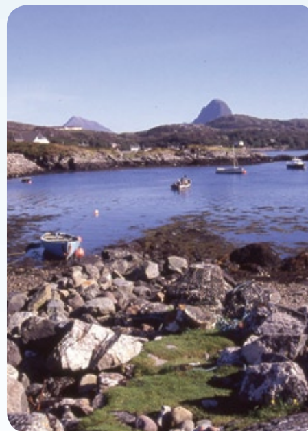
Lochinver by The Highland Council

The sheltered sandy bays and headlands around Gairloch are good sea watching sites. You might get a chance to see pods of common dolphin, a minke mother and calf, harbour porpoise and more rarely basking shark, white-beaked dolphin and killer whale possibly in pursuit of salmon.