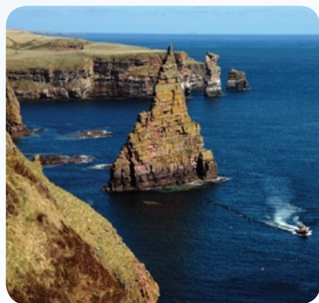
Duncansby Stacks by The Highland Council

Grey seals hunt in the fish-rich waters around the Boars of Duncansby where the tidal surge flows like a river through the sea. In late autumn mothers rear their pups on the rocky shores. Nearby is Duncansby Head, with its seabird cliffs and stacks.