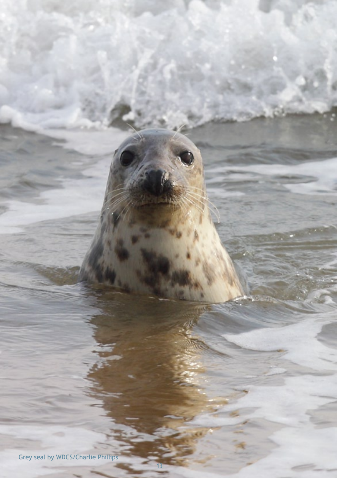
Grey seal