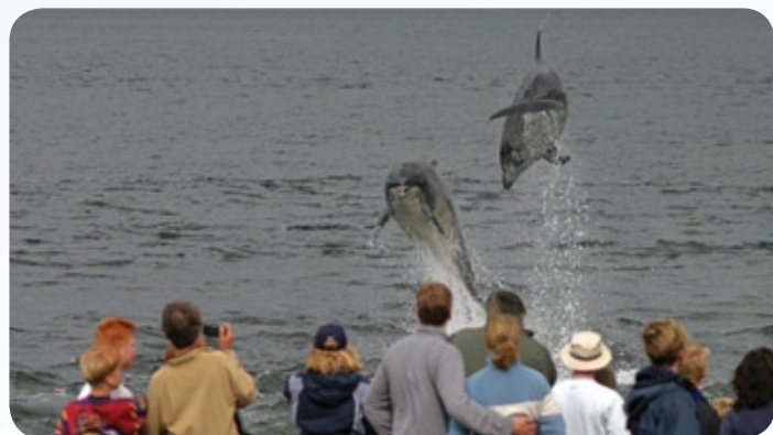
Dolphin watching at Chanonry Point

Although outwith the Highland area, the WDCS Wildlife Centre at Spey Bay provides an excellent introduction to cetacean watching. The centre also has a café and toilets (for more details see p22).