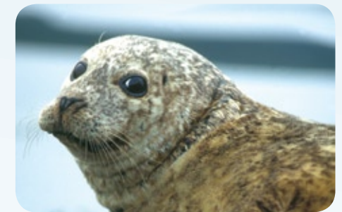
Common seal

Mallaig is a working fishing port and ferry terminus for Knoydart, Skye and the Small Isles. Grey seals bob among the boats in the harbour and gulls, hunting for fish scraps, scream overhead. The ferry passages take you into cetacean territory.