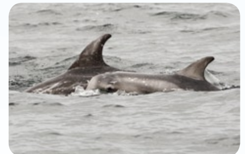
Risso's dolphins