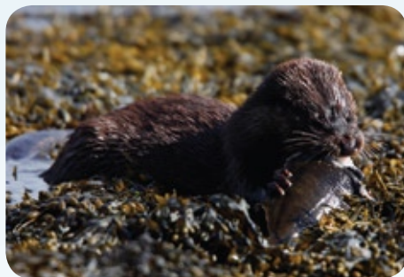
Otter and fish

Here elusive otters join oystercatchers on the beach backed by flower-rich machair meadows. Three hundred common seals live on the offshore islands and reefs, being joined by grey seal visitors in autumn.