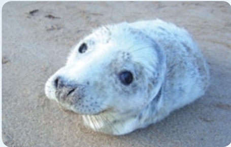
Grey Seal pup by The Highland Council

Report dead seals or cetaceans to the Scottish Agricultural College Tel: 01463 243030.