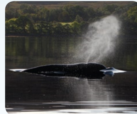
Whale venting

What is the size and shape of the dorsal fin? Is it upright like an orca, sickle-shaped like a dolphin, low and triangular like a porpoise, or small and two-thirds down its back like a minke? Can you distinguish colours or patterns?