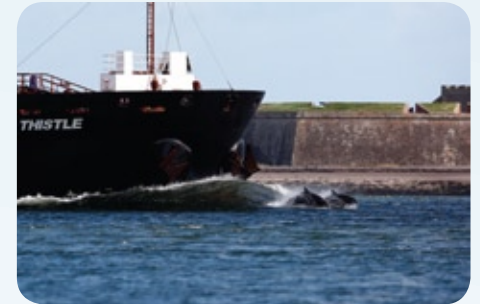
Bow-riding dolphins

Up to 3.8m long. Tall, curved dorsal fin. Very pale to white in some cases. Large rounded head, no beak. Often heavily scarred with scratches from head to fin. Breaches and vertical half-rise out of the water to view the surroundings (known as spy-hops).