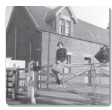
Level crossing, 1951

10 In 1849 the austerelooking Free Church building, on your left, replaced a temporary wooden building where over a thousand people worshipped.