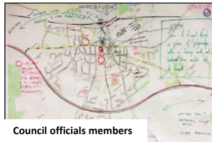
Council officials members