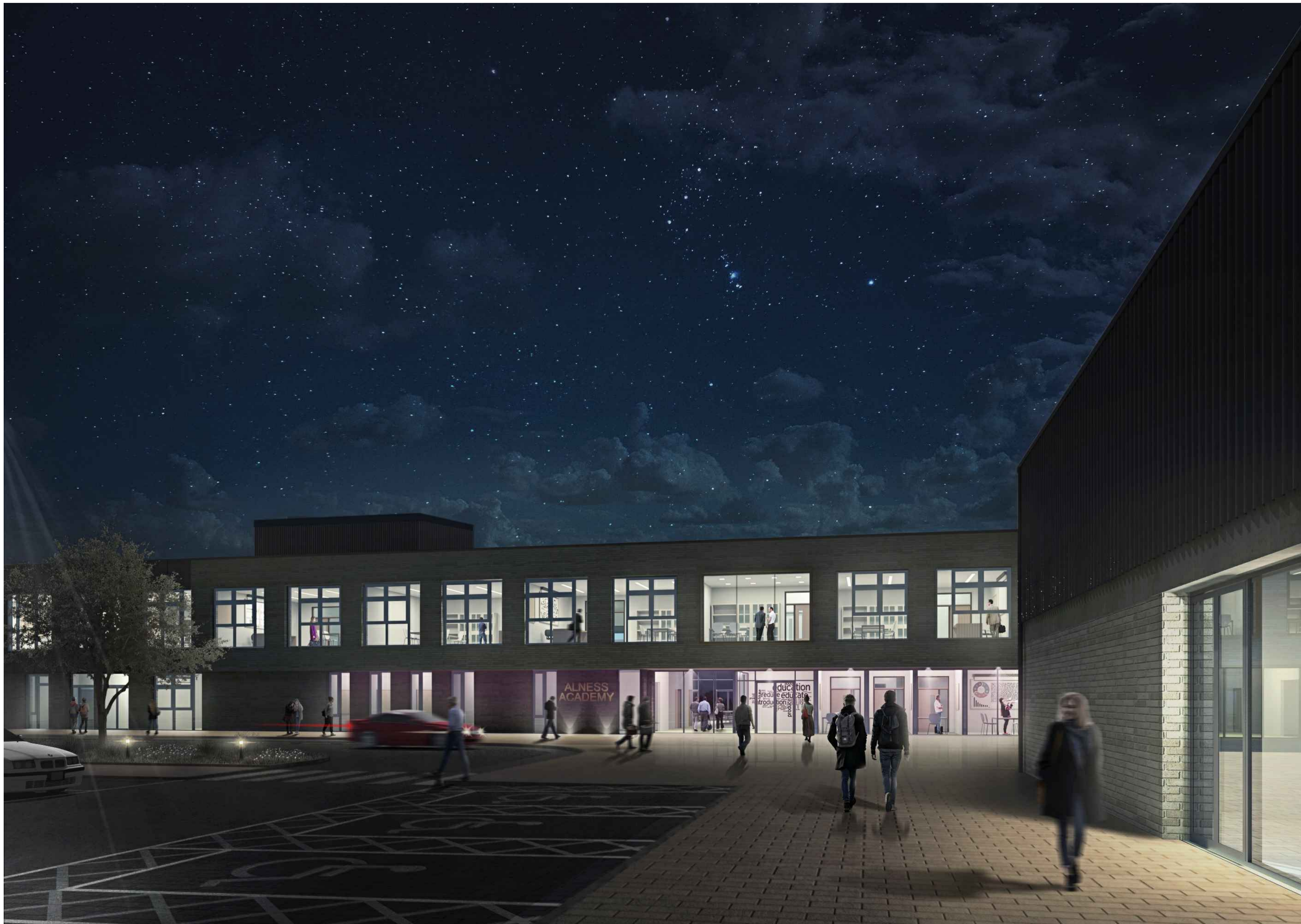
VIEW FROM NORTH WEST, LOOKING FROM OUTSIDE THE SWIMMING POOL ACROSS TO THE MAIN ENTRANCE

NOTES: 1. THIS DRAWING NOT TO BE SCALED. FIGURED DIMENSIONS ONLY TO BE TAKEN. 2. SHOULD ANY DISCREPANCIES BE FOUND WITH THIS DRAWING, PLEASE INFORM THIS OFFICE. 3. COPYRIGHT OF THIS DRAWING IS OWNED BY JM ARCHITECTS.