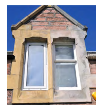
uPVC window (left) of different design, detail, material and appearance to adjacent to full-pane timber sash window.