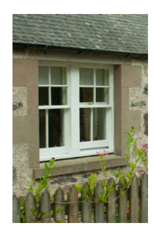
Variation in glazing pattern can add character and distinctiveness.