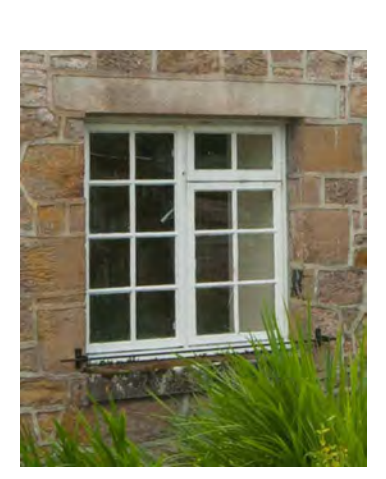
Multi-pane casement windows.