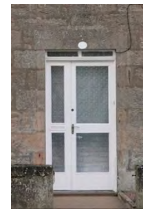
Glazed door with fixed panel. Doors should be made to fit the proportions of the doorway; infill panels are not acceptable.