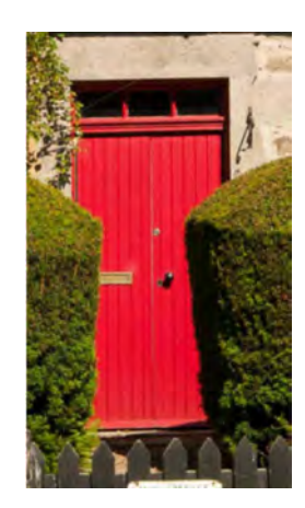
Double-leaf plank and batten door with top light.