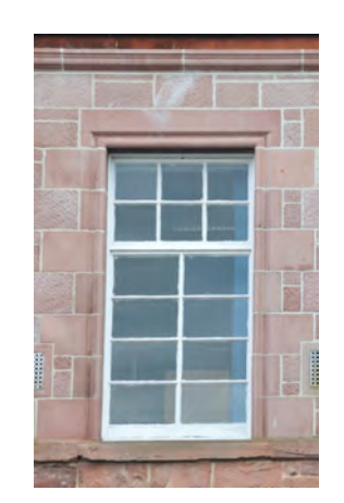
lying-pane (horizontally-laid) glass.