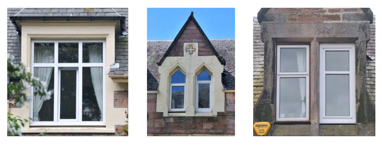
The uPVC windows lack profile and are flat with the mullions and transoms set flush to the glass. The frames appear overly wide. Centre and right show adjacent windows: the mismatch in dimensions and detailing detracts from the overall appearance of each building