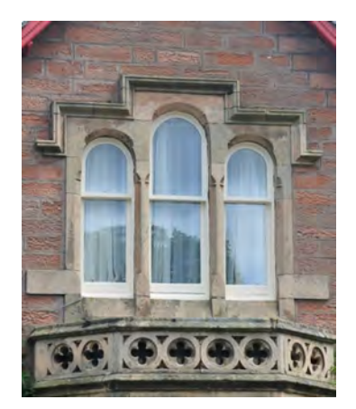
Full pane sash windows.