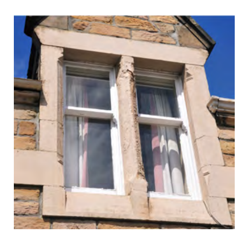
Note how the top sash projects over the lower sash. This example has 'horns'.