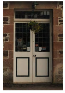
Pair of traditional half-glazed or casement doors.