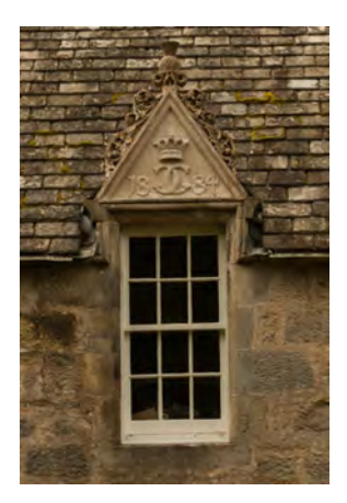
12-pane sash window. Note the slender glazing bars, or astragals.