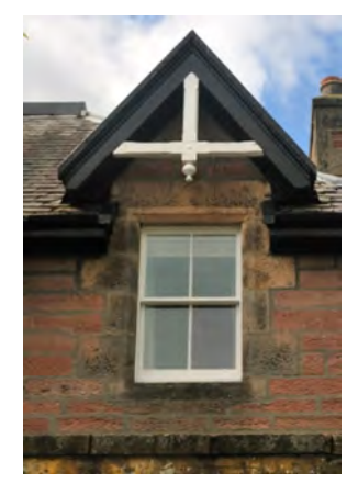
4-pane sash window.