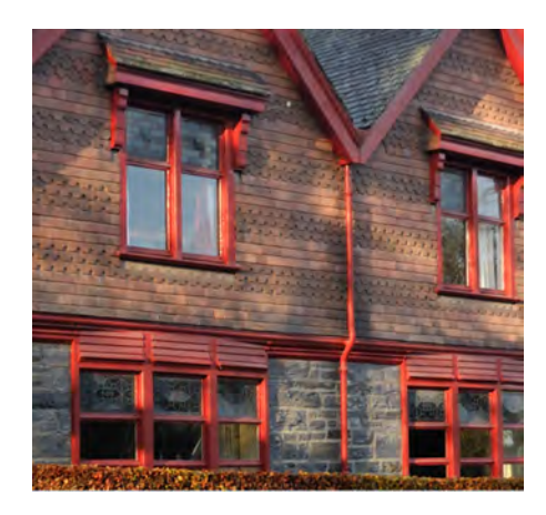
Casement windows with ornate stained glass.