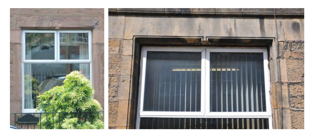
Central mullion removed to enlarge opening resulting in a poorly proportioned window with subsequent inappropriate window style, material and design.

Mahogany-effect uPVC with no definition between upper and lower sash (left). Top sash projects from lower sash as per a traditional window but the materials and details (trickle vents on the front face of the window and incorrectly used sash horns) are inappropriate to a conservation area (right).