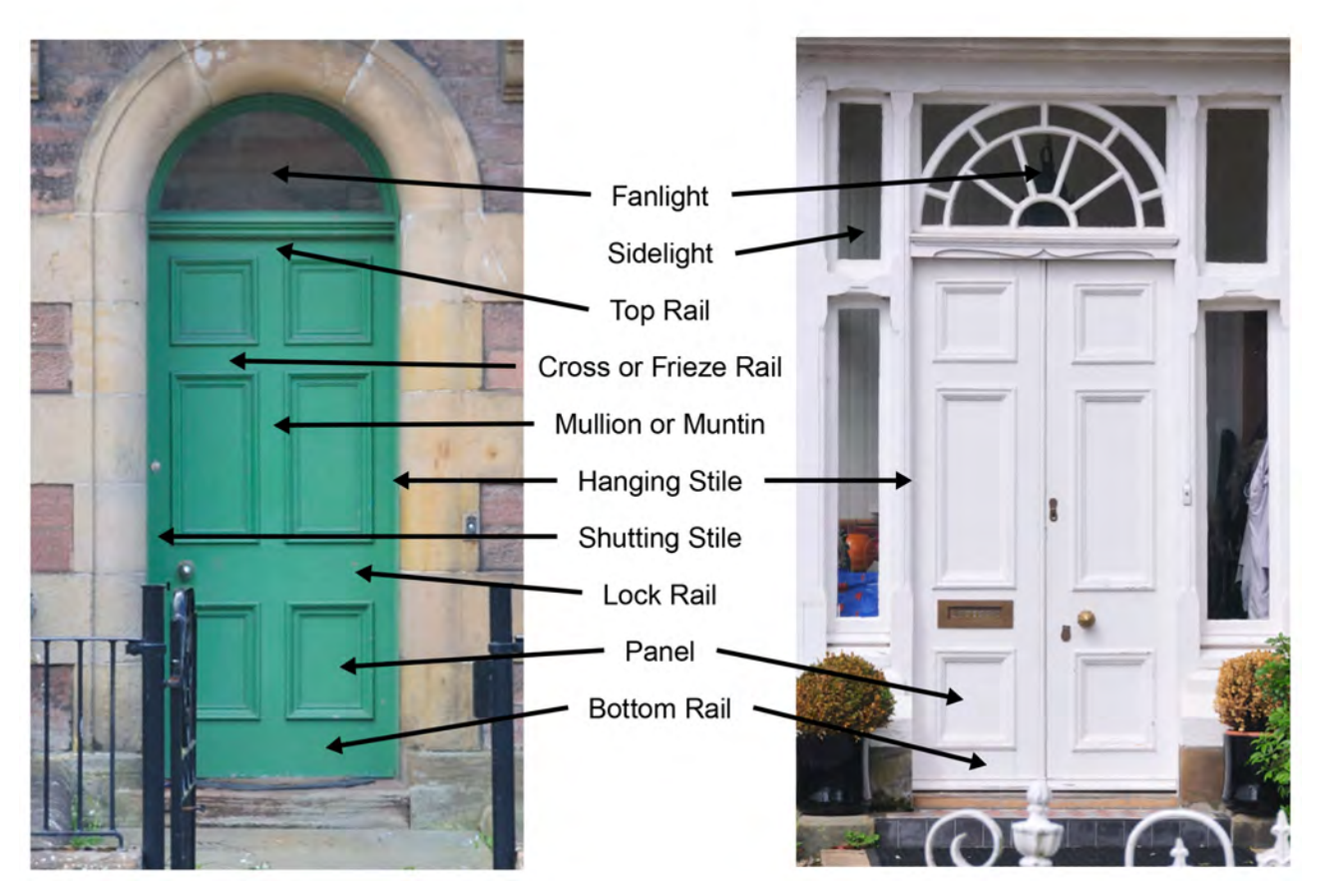
Figure 3.1 The anatomy of a traditional sash and case window and traditional doors.