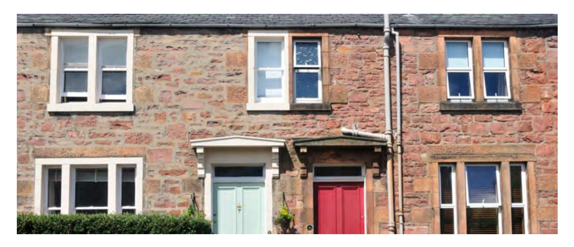
Sash windows have a distinctive look when open or partly open. The building on the right demonstrates why top hung sashes are not appropriate.