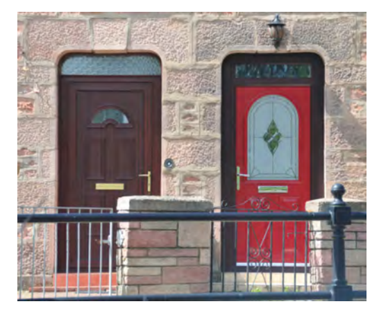
This pair of off-the-shelf uPVC and half glazed doors do not match one another as intended and also detract from the character of the building and wider area.