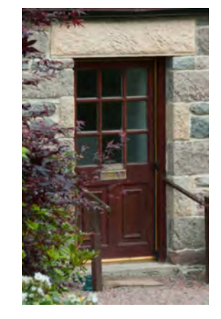
A half glazed inappropriate modern aluminium door, the poor finish, appearance and style accentuated by the adjacent traditional timber 4 panel double margin door.