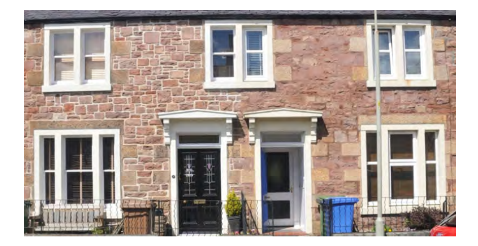
A building with traditional timber sash windows (left) alongside a building with replacement uPVC windows. The difference is striking. Note the flat appearance of the uPVC windows which also have wider frames, transoms and meeting rails (especially on the ground floor window) and tilt, rather than slide.

with upper sash stepped out from lower. However, the plant-on astragals on the upper sash, material, wide stiles and transom, detailing and finish make this unit far inferior to the timber sash window.