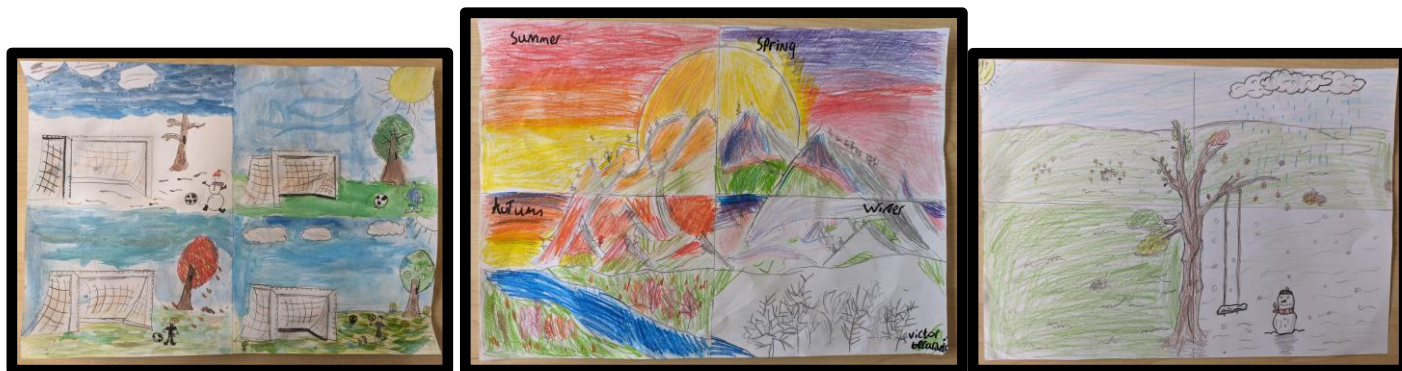
Artwork created by our P6/7 class.

Teachers follow a carefully structured approach to learning the key skills of art and design. The programme introduces these skills at a fundamental level in P1, and builds on this knowledge through to P7.