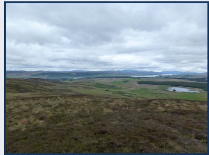
Loch Dola and Loch Shin

8 An alternative access can be made from the Saval road.