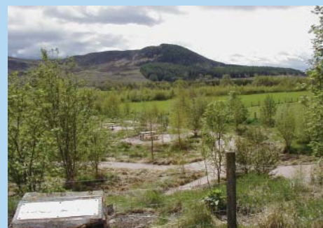
Laggan picnic site

A pond has been created with a small board walk to encourage pond dipping events for children and a viewpoint with a bench to allow for a quiet moment. The viewpoint was created in conjunction with The Highland Council's Planning and Development Service. The small pond and waste ground area opposite the community shop and owned by the Laggan Trading Company has drastically improved! A series of all-ability paths has been created, the pond cleared out and re-sculpted and picnic tables provided. The community are really pleased with this project and intend to use it as a community resource for events and barbeques etc.