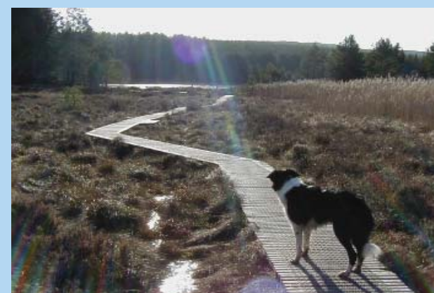
Uath Lochans Boardwalk

All maps©Crown copyright, The Highland Council 100023369 2005