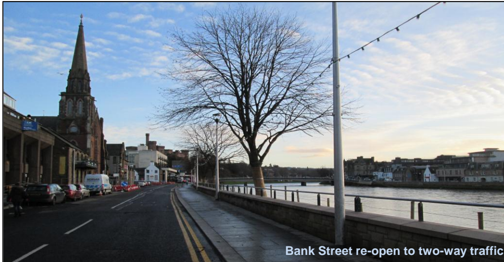
Bank Street re-open to two-way traffic