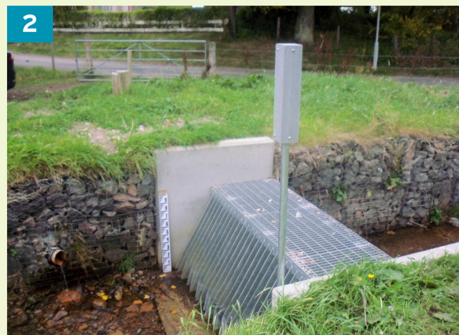
2 Flow monitoring station, Tower Burn