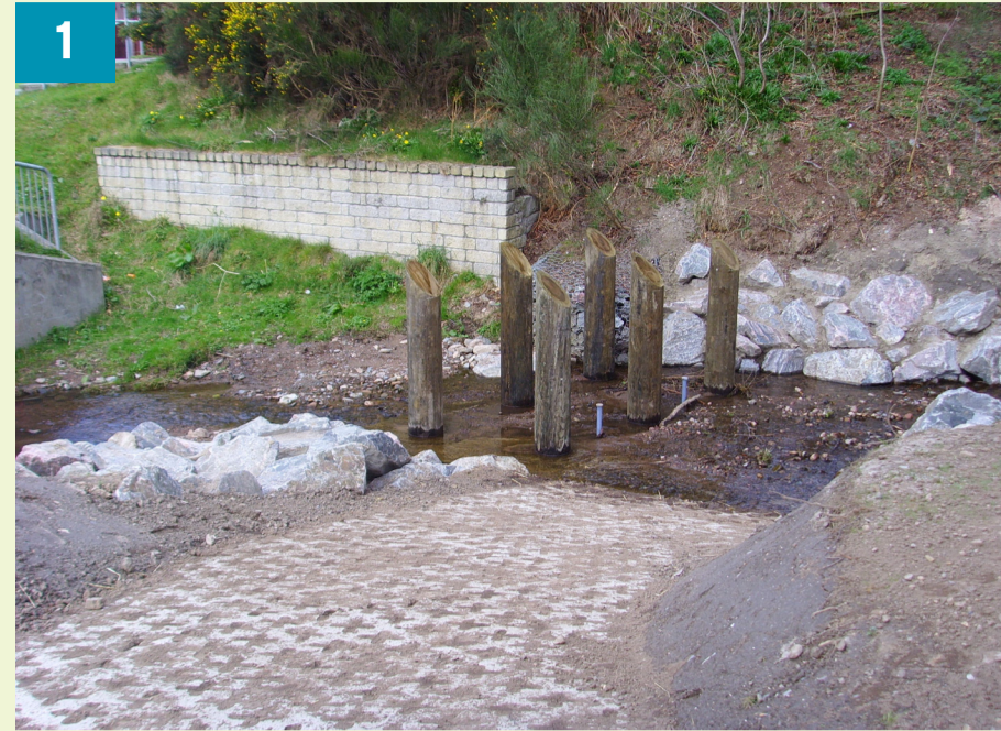
1 Coarse debris screen, Tower Burn