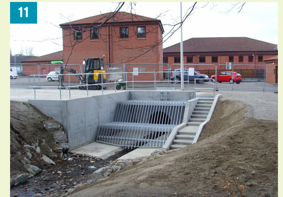
11 New trash screen, Culloden Centre