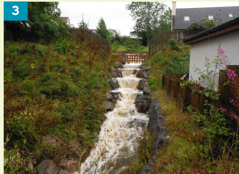
3 Creation of step pools to protect against erosion