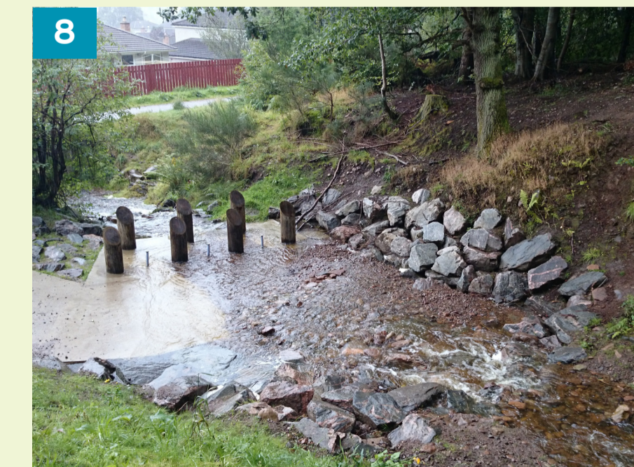
8 New coarse debris screen, Culloden Wood