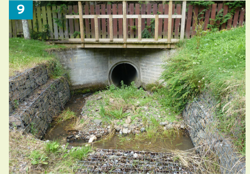
9 Removal of inappropriate screen, Redburn Avenue