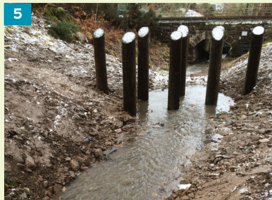
5 New coarse debris screen, Smithton Burn