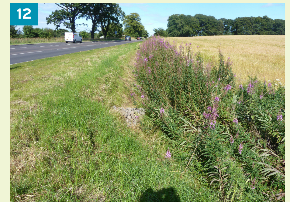
12 Roadside drainage improvements to A96