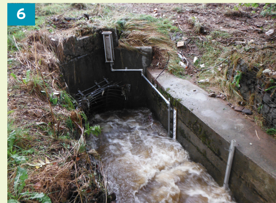
6 New flow monitoring station, Smithton Burn