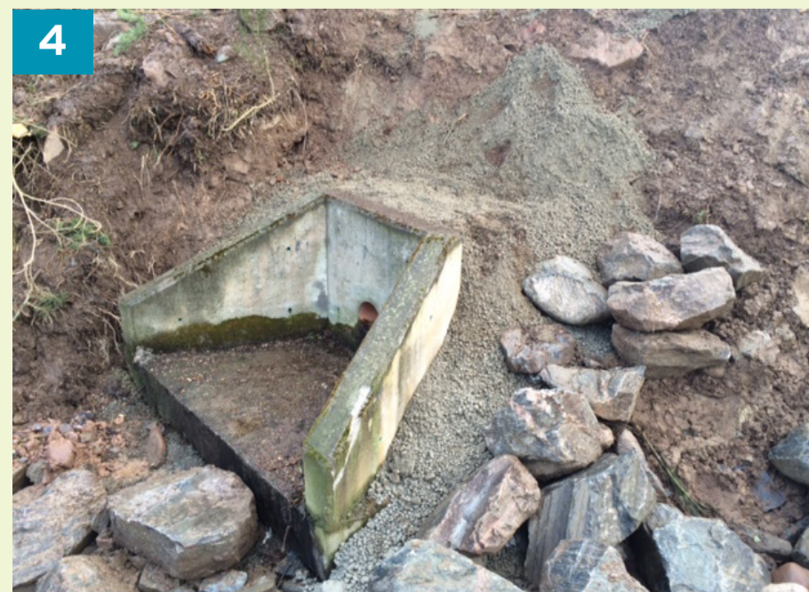
4 Channel restoration and headwall reinstatement (work in progress)