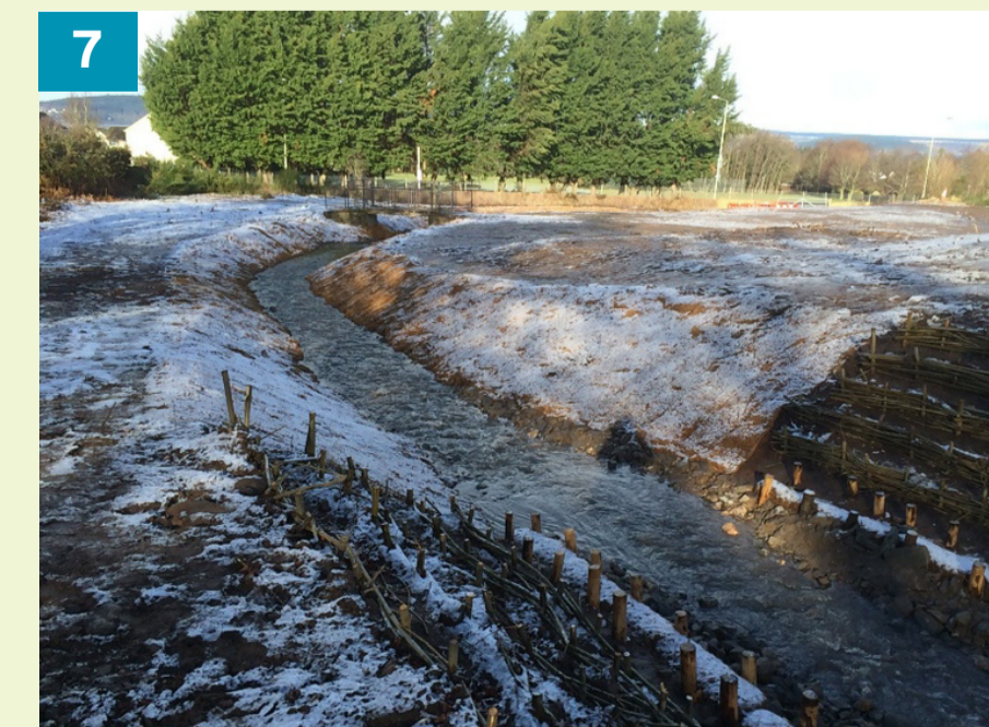
7 Restoration of the Smithton Burn at the site of the former care home