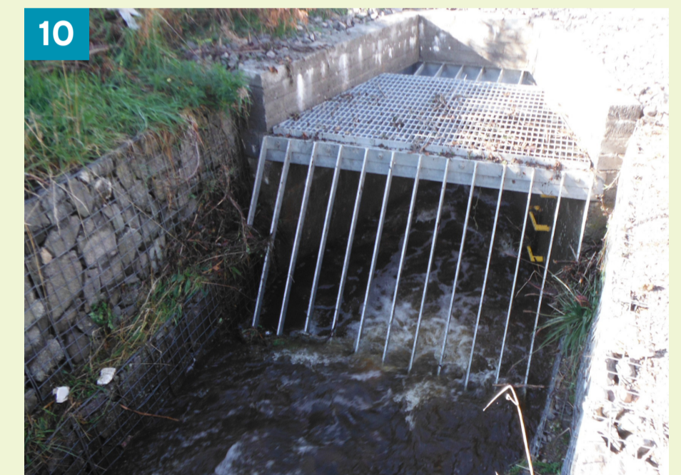
10 New, improved screen installation operating during 2014 floods.