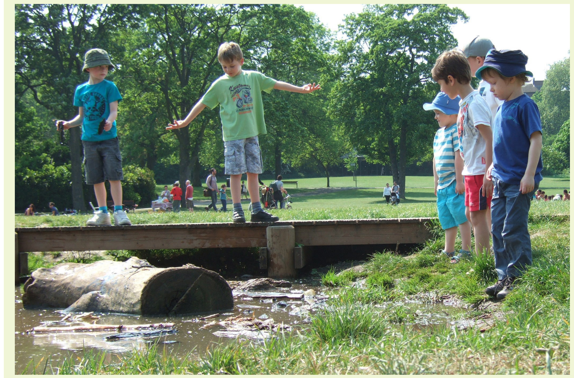
Informal water features based on a natural spring in north London

Our scheme should be seen in the wider context of Smithton and Culloden. By making public green spaces more interesting, we can encourage people to take greater interest in their surroundings and community, particularly where these spaces are linked by existing footpaths. More activity through walking and cycling leads to improved physical and mental well-being.