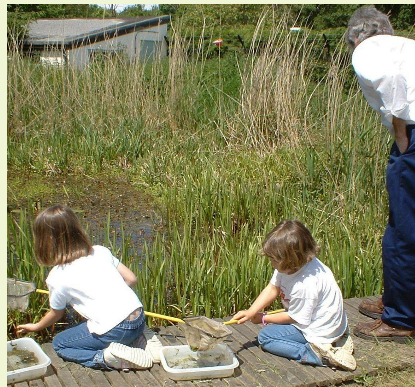
Dipping platforms offer educational opportunities

Water provides a new dimension for outdoor activity, offering wider opportunities for observing wildlife and interacting with nature, developing skills and discovery through education.