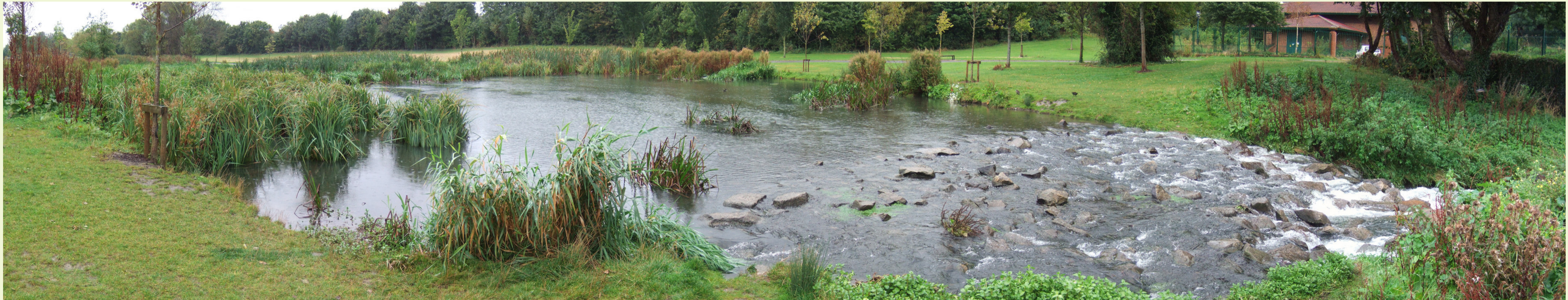
Restored channel through Kilbogget Park, Dublin during high rainfall and flow levels

Our designs will take account of existing site activities, including formal sports that use the pitches in Smithton and Culloden Parks, as well as more informal pursuits such as sledging. Future management requirements will also be a key requirement of the detailed designs. Storage areas and new habitats require very different maintenance regimes than amenity grass, although in many cases this may represent reduced annual costs. We will ensure that communities and stakeholders are engaged and informed throughout the design process and understand who will look after the site once it is complete and in operation.