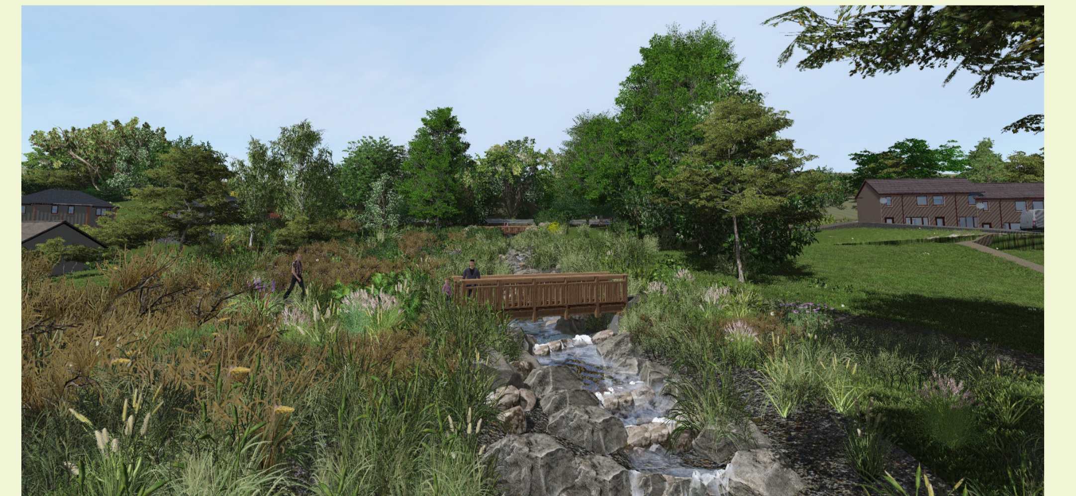
Concept visualisation: looking towards the railway