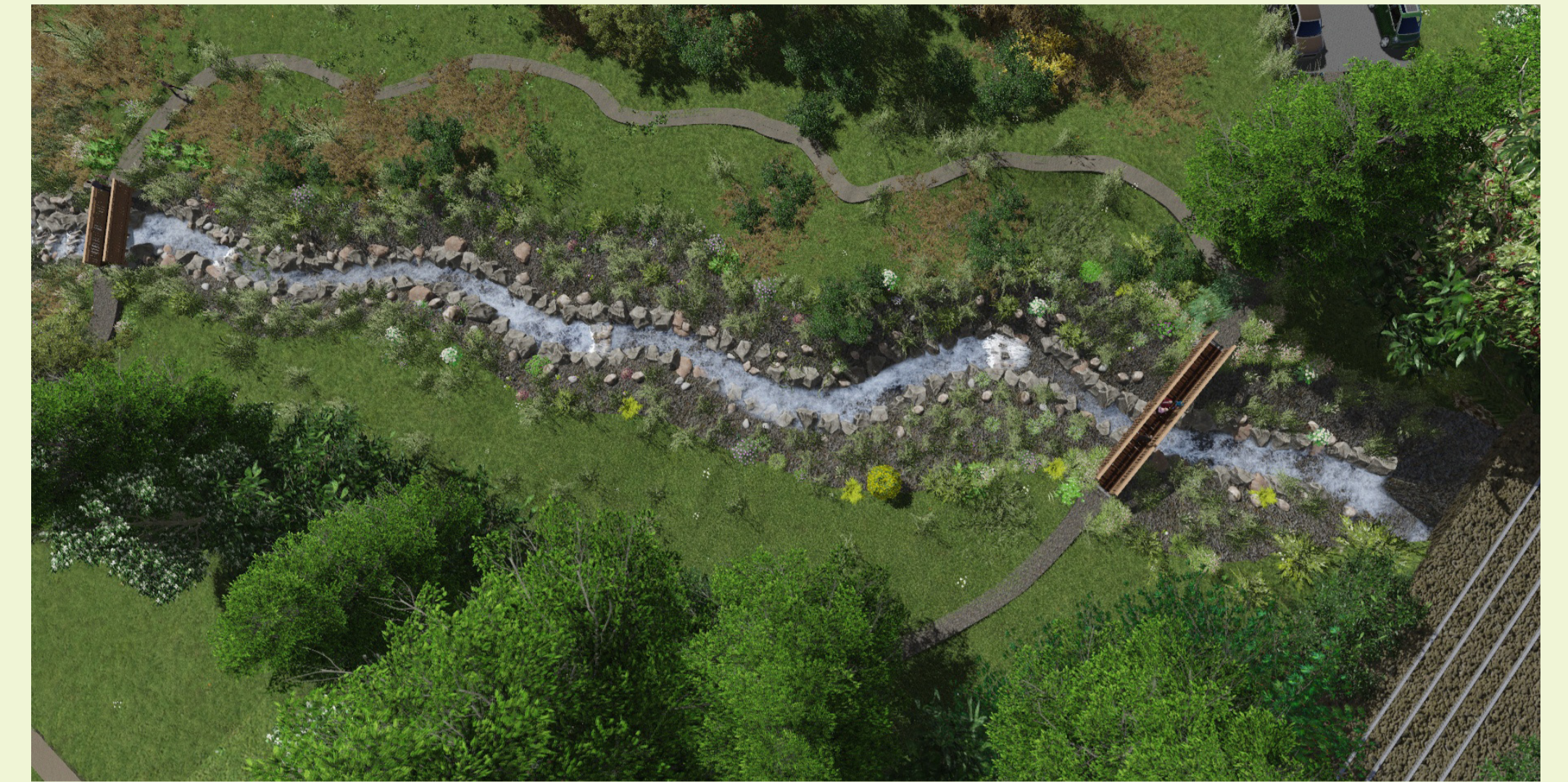
Concept visualisation: aerial view

By opening up the stream, it is hoped to encourage pedestrian access. This should reduce nuisance activities such as fly-tipping. An accessible, restored channel would provide a new, more attractive and safer community open space.