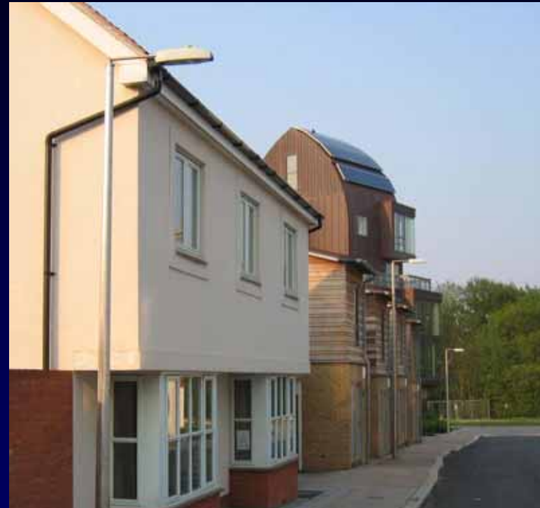
New Hall, Harlow