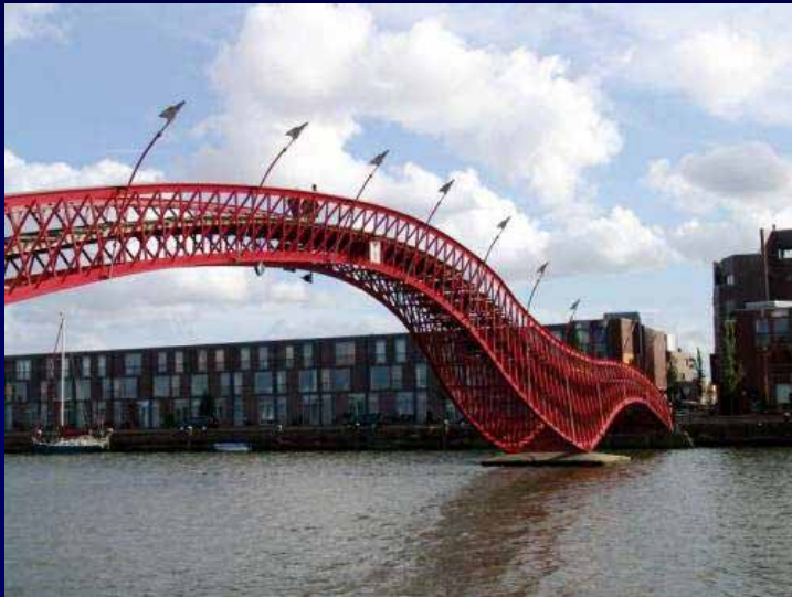
Pedestrian bridge, Amsterdam Eastern Docklands