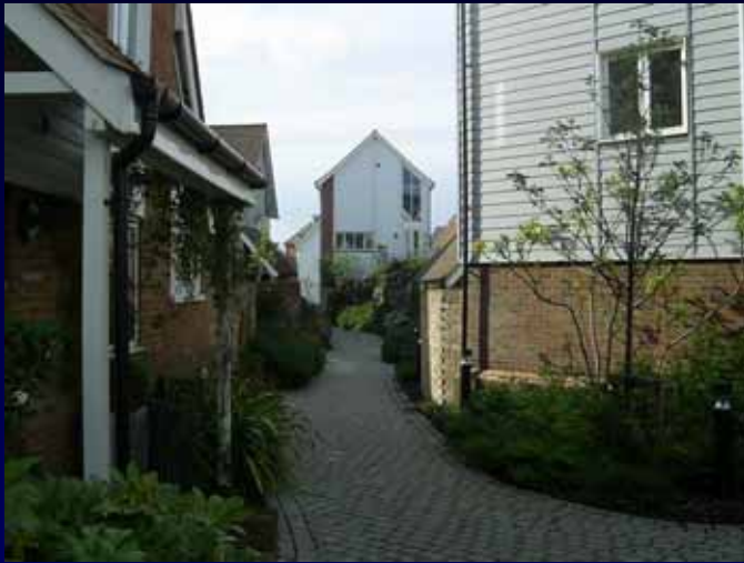
Strong pedestrian network, Lacuna, Kings Hill, Kent