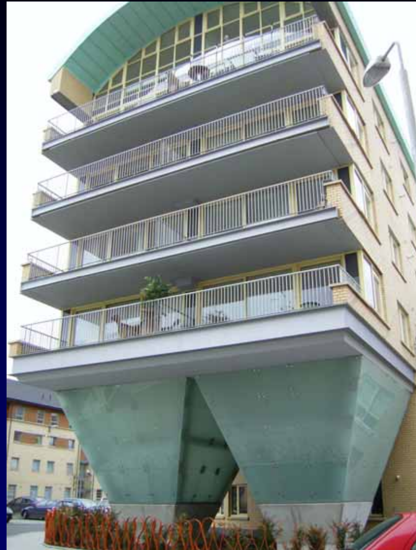
New Gorbals, Glasgow