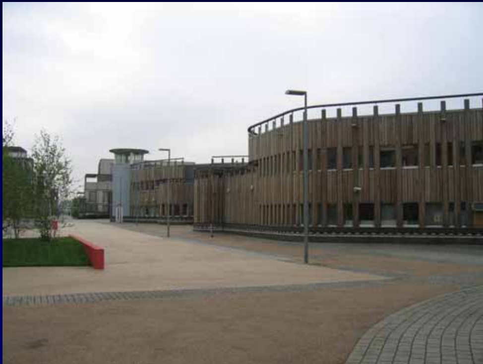
Greenwich Millennium Village, London