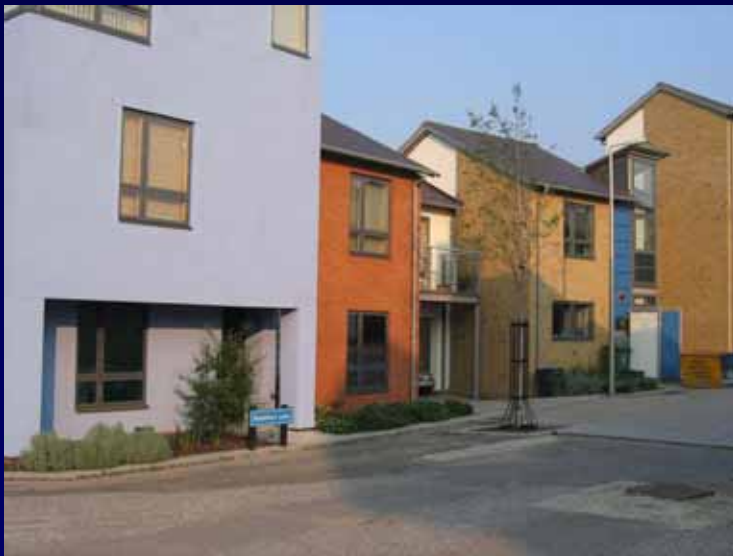
New Hall, Harlow