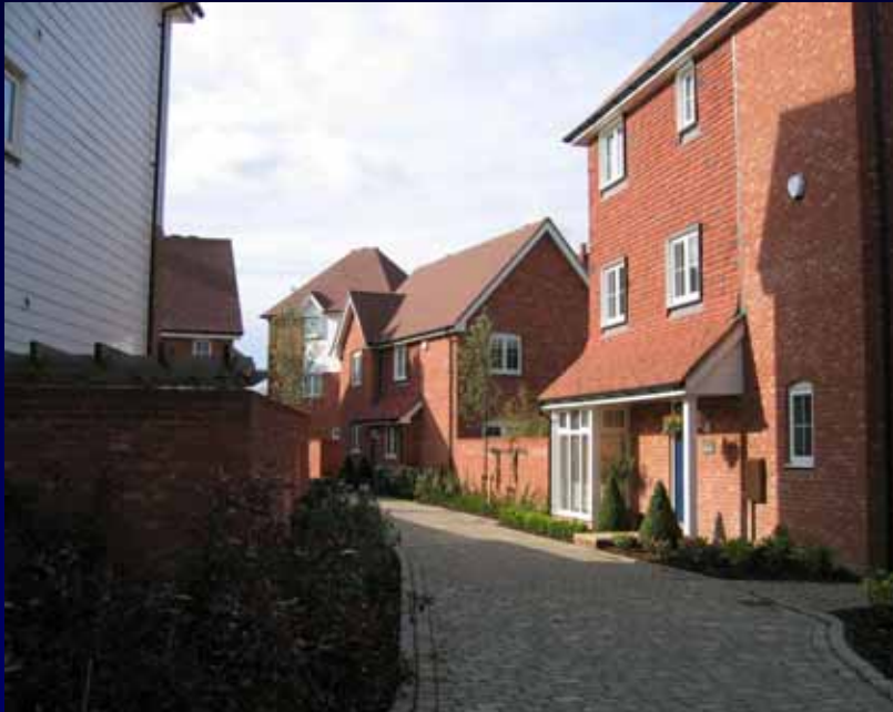
Lacuna, King's Hill, Kent