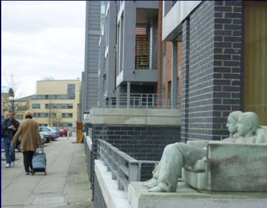
New Gorbals, Glasgow