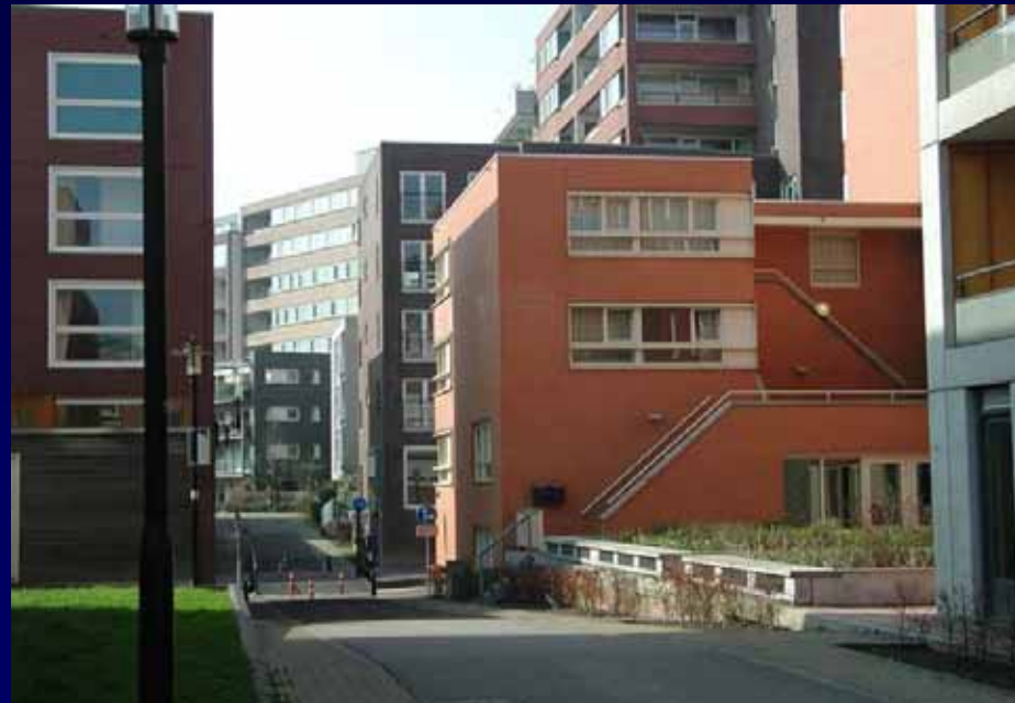
Pedestrian friendly core, Amsterdam Eastern Docklands