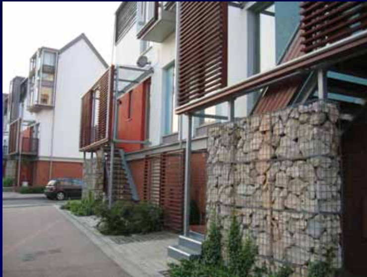
New Hall, Harlow