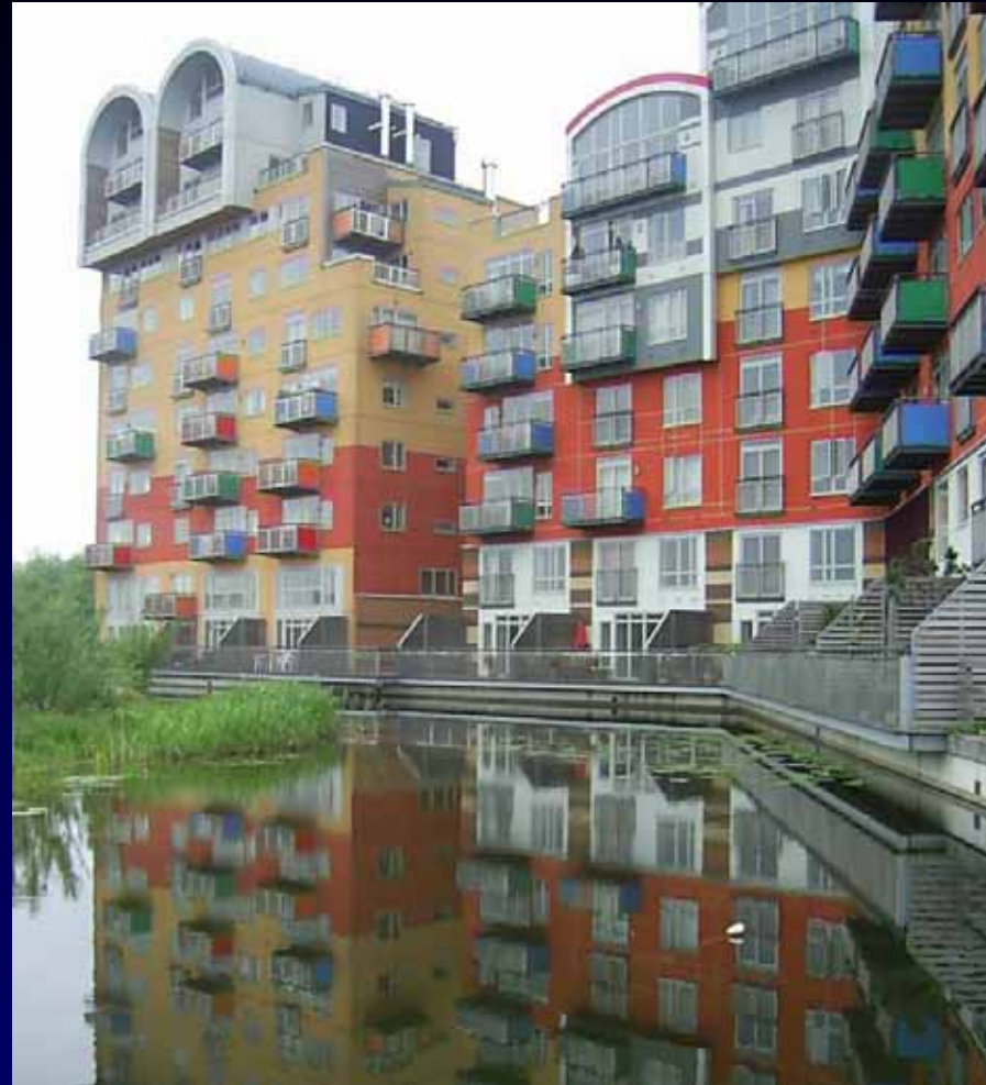
Barrel-vaulted roof apartments, Greenwich Millennium Village, London