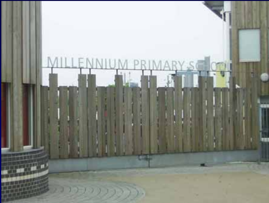
Primary school at Greenwich Millennium Village, London