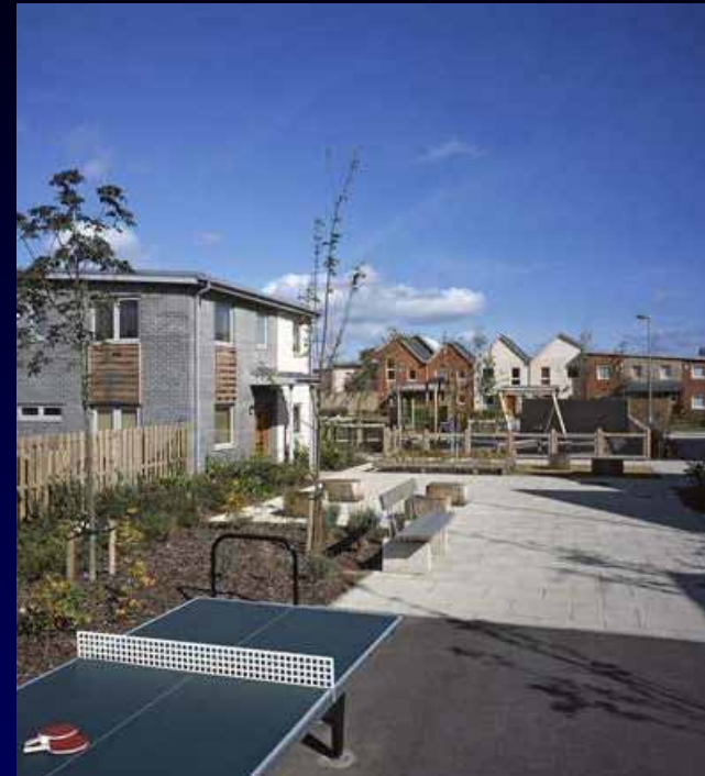
Staiths South Bank, Gateshead