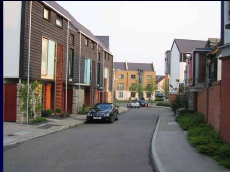
Borneo Sporenburg, Amsterdam Eastern Docklands