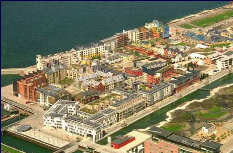
Permeable block structure – Malmo, Sweden