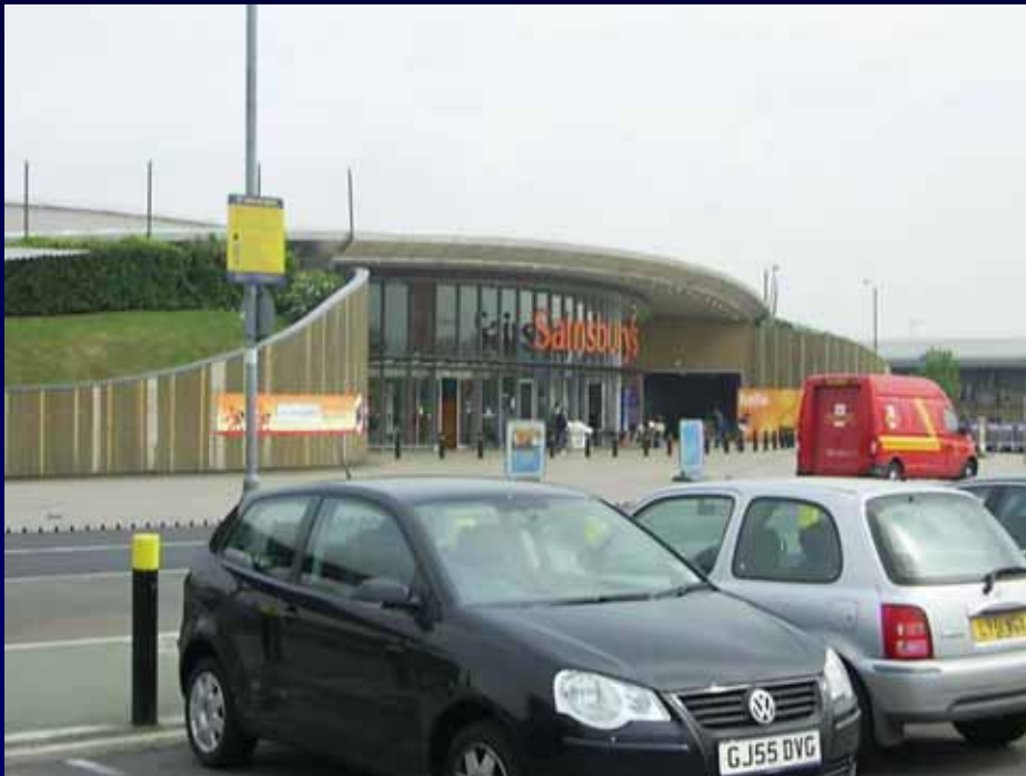
Greenwich Millennium Village, London