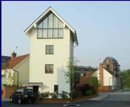
New Hall, Harlow