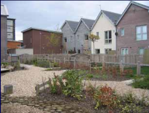
Staiths South Bank, Gateshead