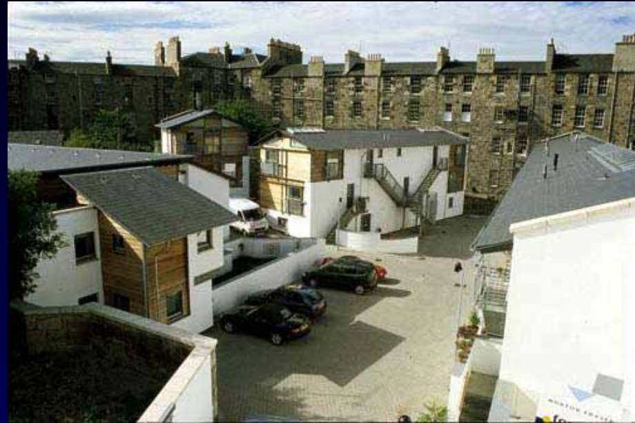
Housing at Dublin Street Lane, Edinburgh