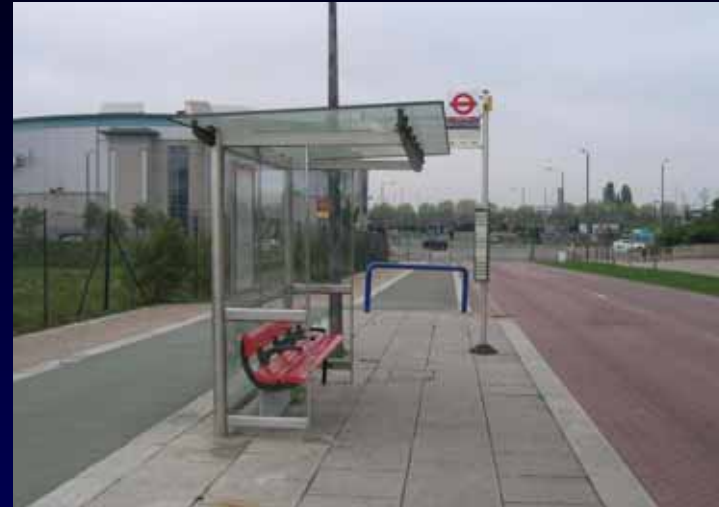
Greenwich Millennium Village