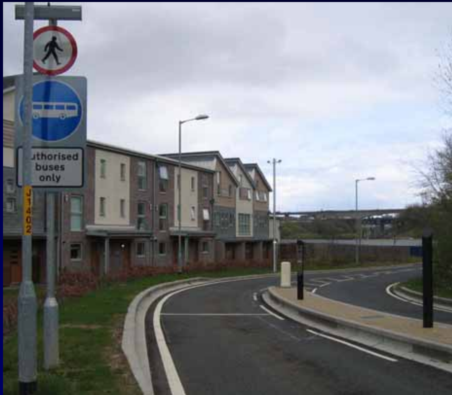
Dedicated bus routes – South Staiths, Gateshead