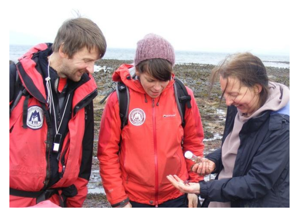
Getting up close and personal with coastal critters on the Countryside Ranger training weekend.