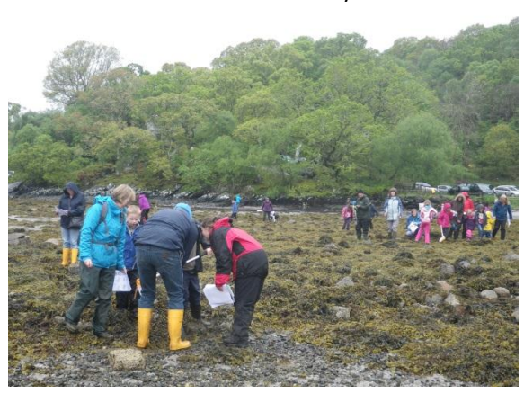
Investigating seashore life at low tide on one of the Glenuig Seashore Festival day.