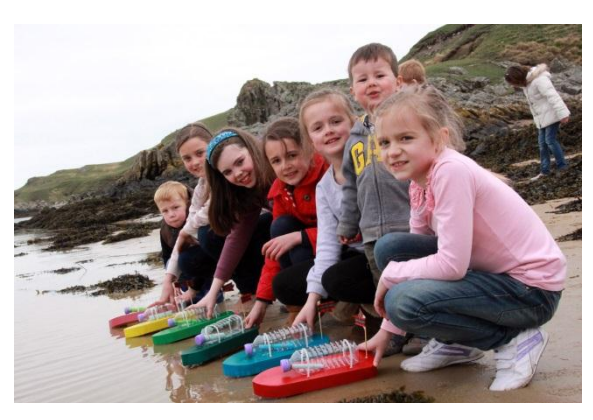
Launching St Kilda mailboat replicas at the Strathnaver Seashore festival.