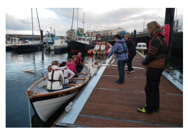
Coastal rowing session, part of the 'Wick Waves' Festival.