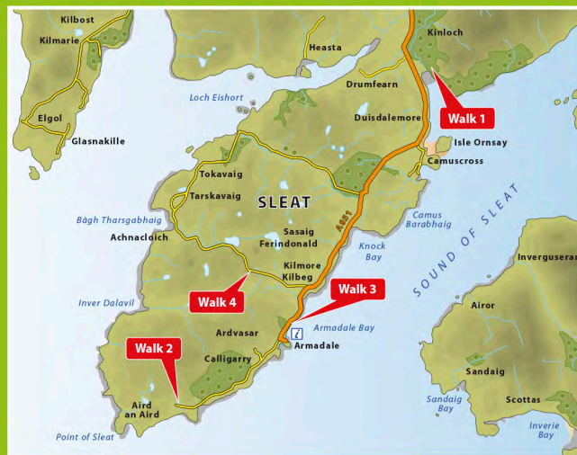
© Crown Copyright. The Highland Council 10023089

Further details on the Core Paths Plan and Countryside Access, see The Highland Council Website highland.gov.uk/leisureandtourism/what-to-see/countrysideaccess/