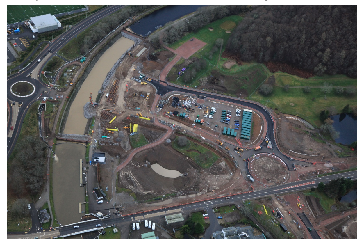
Aerial photo of the site from the North – dams installed and piling rig working on West abutment