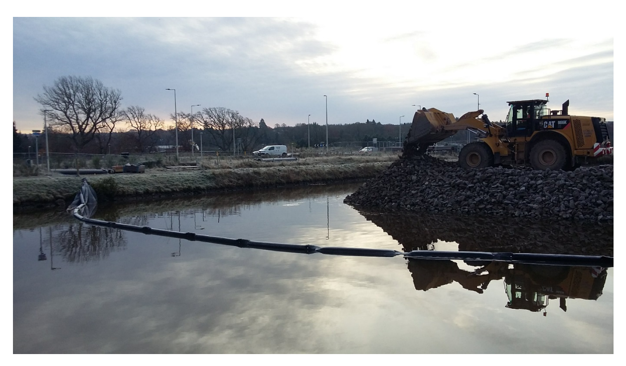
Installing Rock Dam across the canal with wheeled shovel – Silt Curtain in place