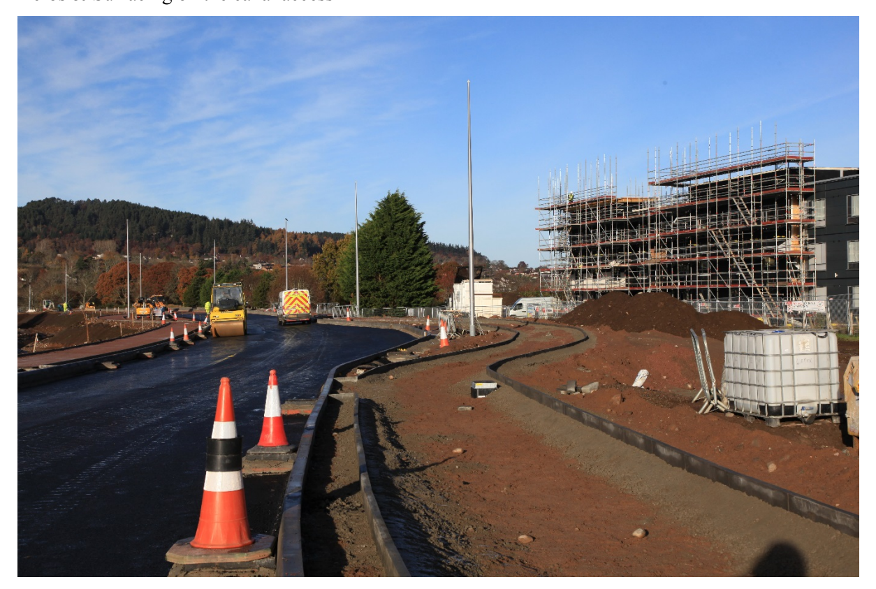
Surfacing and new bus stop on new General Booth Road