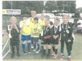
HIGHLAND AUTUMN HOCKEY FESTIVAL 2019