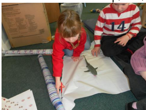
Children independently wrapping a present.