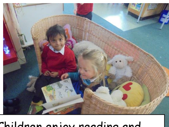
Children enjoy reading and retelling stories.