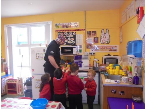
One of our Dads, a chef, came in and helped us to bake delicious cakes.