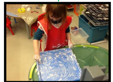
Making marks and writing in shaving foam