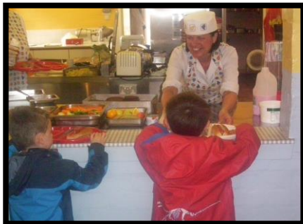
Nursery children experiencing a school lunch in the canteen.