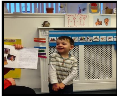
This confident individual is telling his friends about the time he spent at home with the Nursery bear.