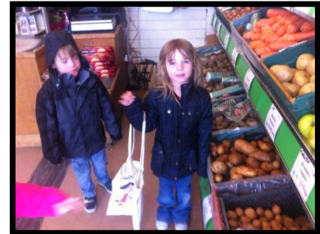
Buying fruit in the Beauly Fruit Shop.

Many of our parents work in or have contacts in local services and have helped to arrange these visits. To enable us to continue with our trips, we need help from parents/carers to maintain satisfactory adult: child ratios. All help is welcomed.