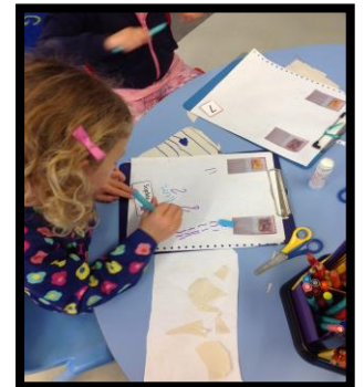
Recording who would like cheese or ham for snack.

Expressive arts: By engaging in these experiences children will develop the ability to represent their own and others emotions in different ways.