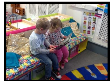
Looking at books in the story corner.