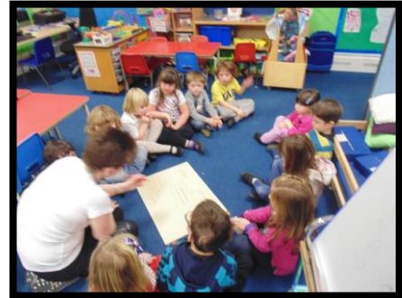
These effective contributors are sharing their thoughts and ideas with each other through discussion.