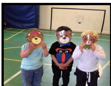
Taking part in role play by acting out 'Goldilocks and the Three Bears'.