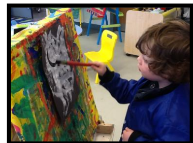
Exploring materials in the art area.