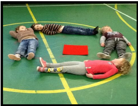
Making shapes with our bodies in the school gym hall.

The Nursery uses the gym and P.E. equipment, the playground, garden and field. We also regularly visit other areas of the school to familiarise the children with the school buildings and staff.