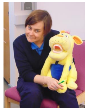
The Oral Health Educator teaches us how to keep our teeth healthy.