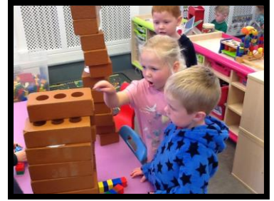
Discussing and comparing the heights of their towers.