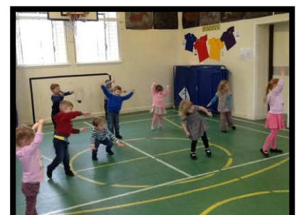
Moving imaginatively to music in the gym.