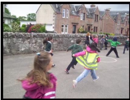
Outside play with the Primary 1 children.

During the summer term, the Nursery children go to the Primary 1 classroom for a weekly visit to familiarise themselves with the routines etc. In August, when your child officially begins Primary 1, the Nursery staff will continue to liaise with the class teacher to ensure your child gets off to the best possible start.