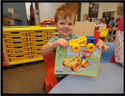
This successful learner has built a model by following the instructions.

Effective Contributors - children find trying new things exciting and persevere even when presented with difficulty. They will be able to work with partners and in groups. They will work out new and different ways of solving problems.