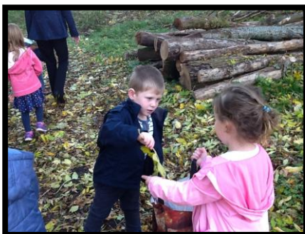
These responsible citizens are sharing resources indoors and out.