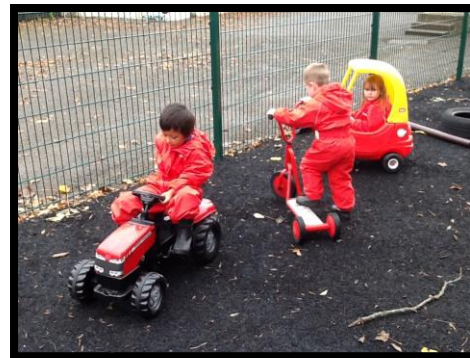
Using the wheeled toys in the garden.