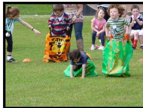
Having fun in the school field on Sports Day.