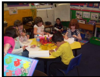
Working in the Primary 1 classroom.