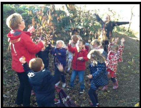
Having fun with leaves in the woods.