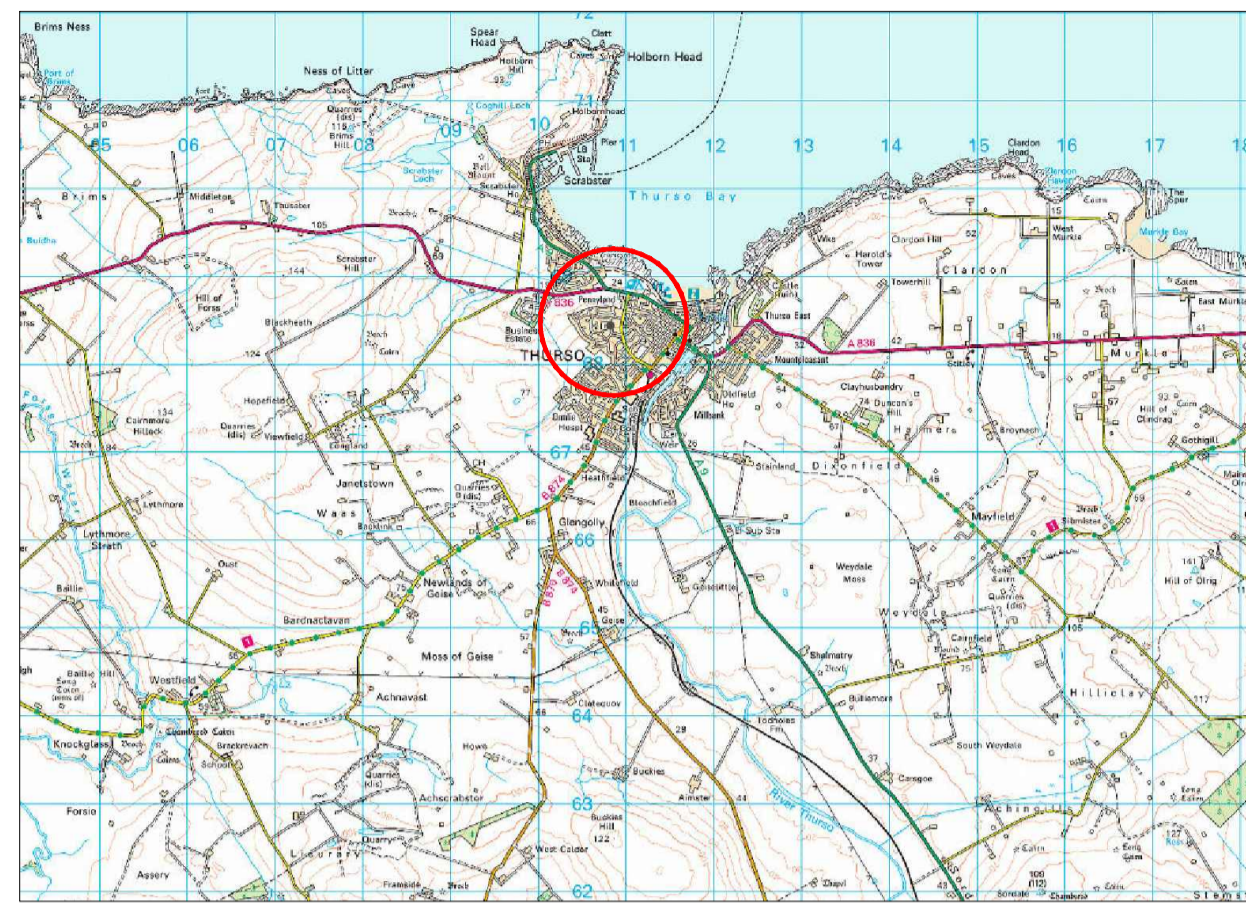
LOCATION PLAN SCALE 1:50,000