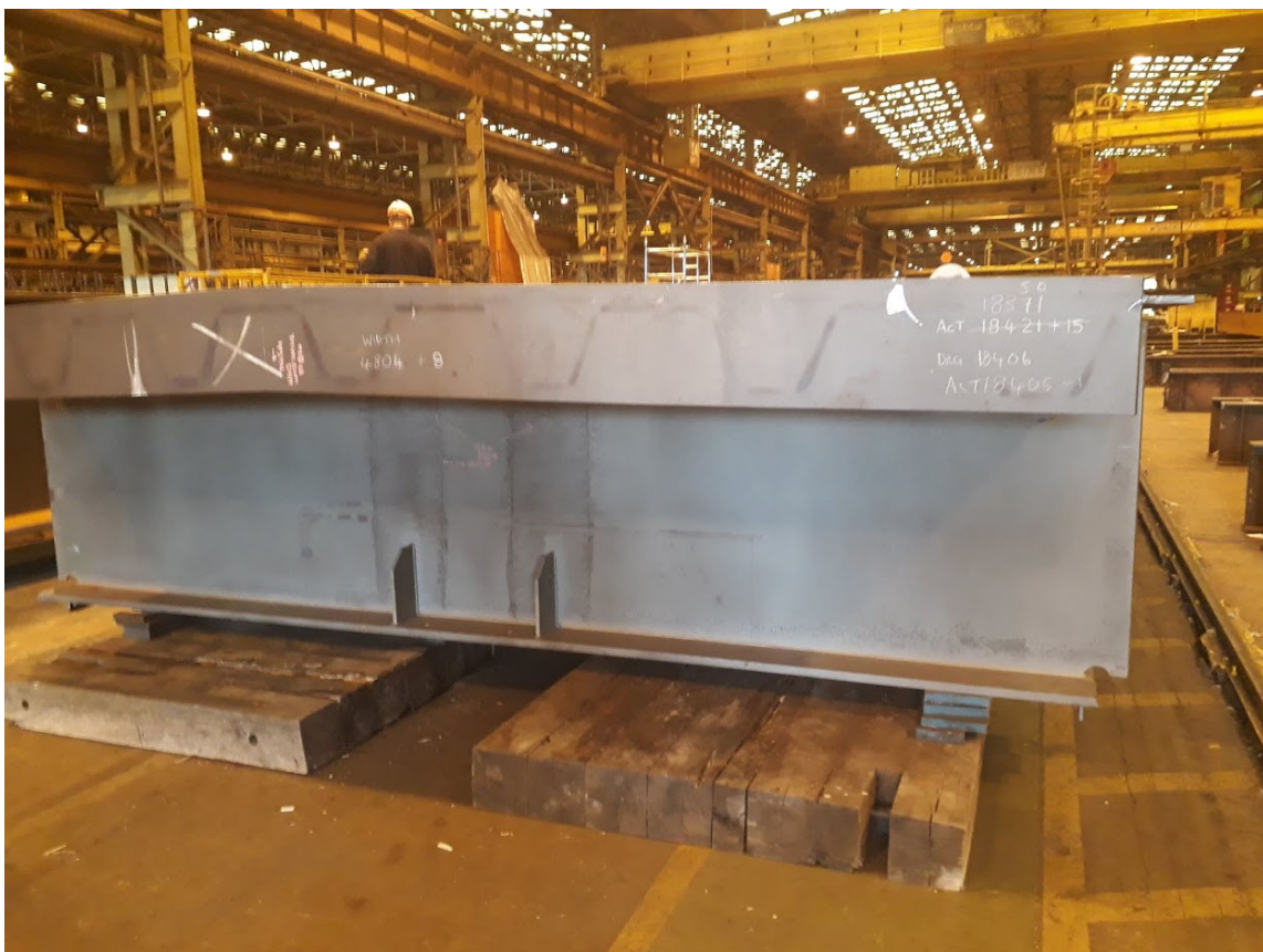
Central nose section of swing bridge during fabrication

Off site the fabrication works continued at Cleveland Bridge, testing of the hydraulic power unit at Hedley Hydraulics and the painting of the completed mechanical assemblies at JGC.