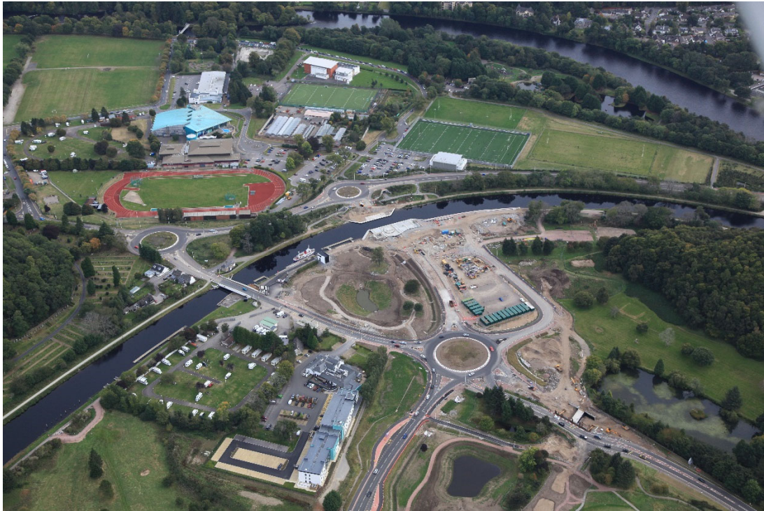
Aerial photo from the West showing the landscaping and creation of ponds adjacent to the golf course and the underpass for the A82