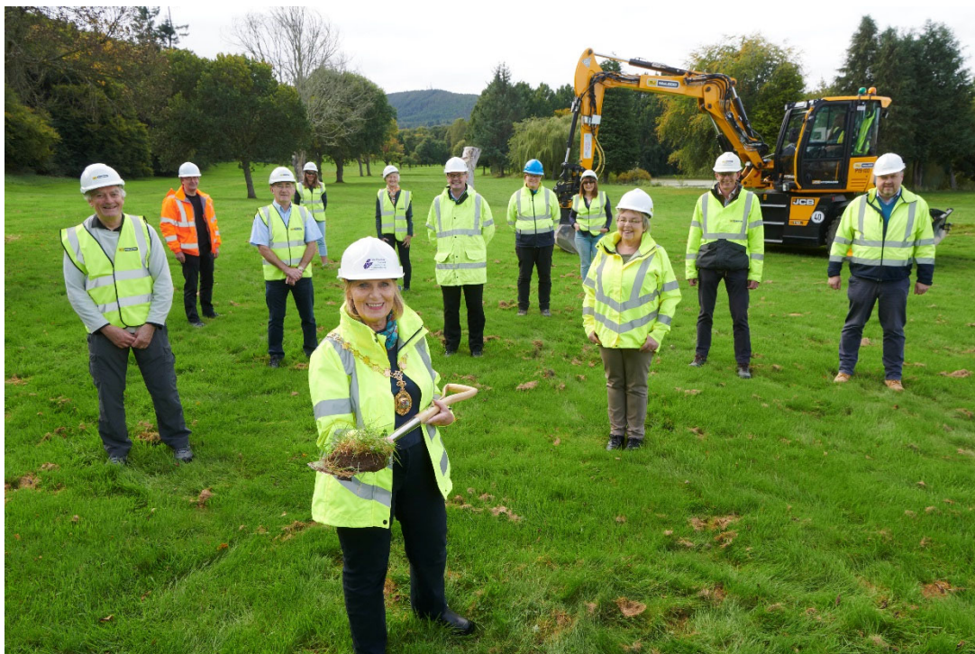
Parkrun turf cutting ceremony