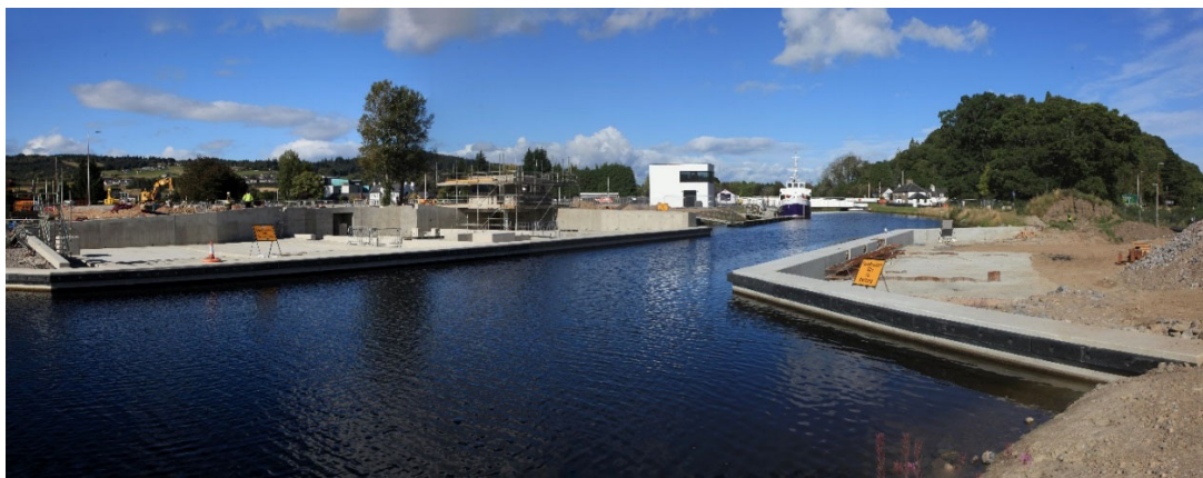
East and West Bridge Abutments with fenders fitted and scaffolding around plant room for roof installation