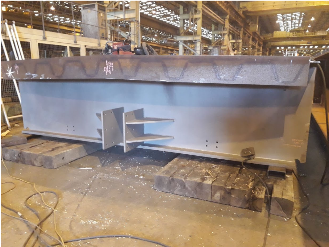
Central tail section of swing bridge with brackets for tail locking pin