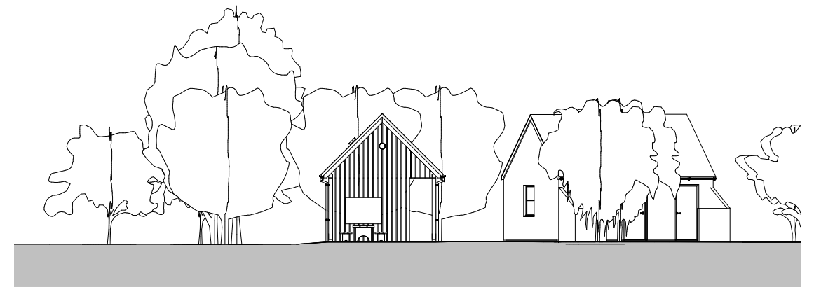
4 East 1 : 200