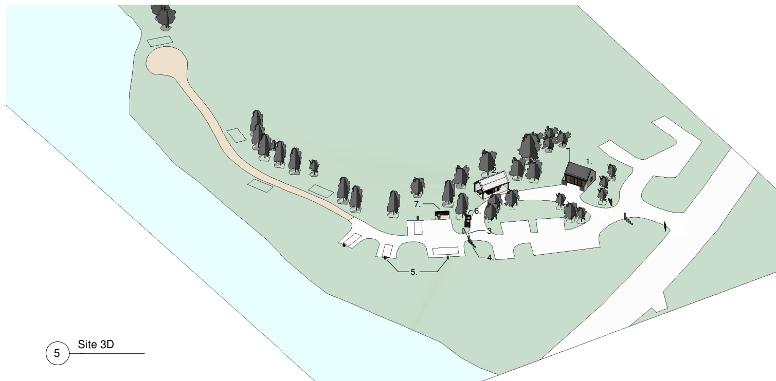
5 Site 3D