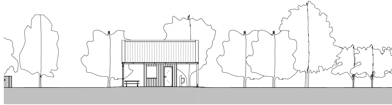
1 North 1 : 200