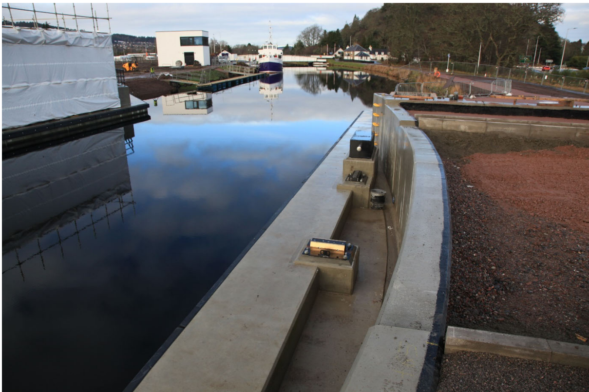
East abutment with the bearings and shock absorber clearly visible