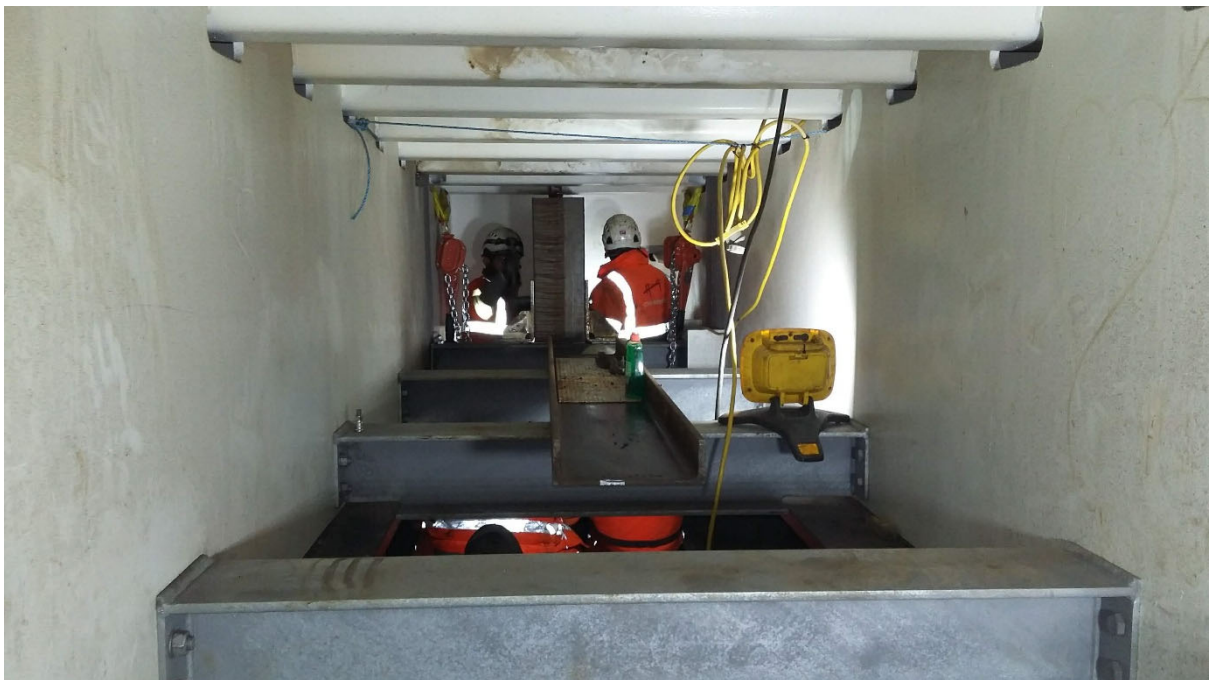
Installation of the steel ballast blocks to the rear of the bridge