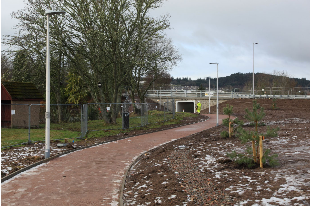
Looking West to the new underpass under the A82 – footpath ready for surfacing