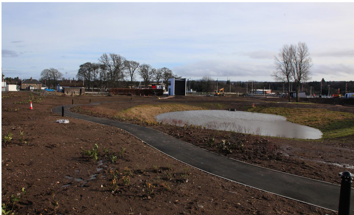
Looking East across the new pond towards the new control building, footpaths and planting