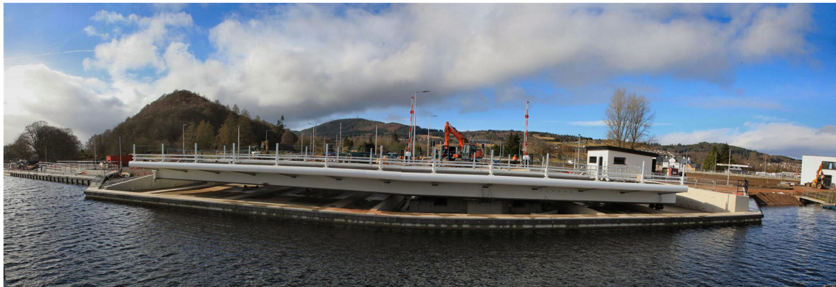
The new swing bridge sitting ready to be turned