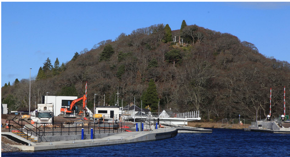
Looking North - The new wharf and nose of the bridge