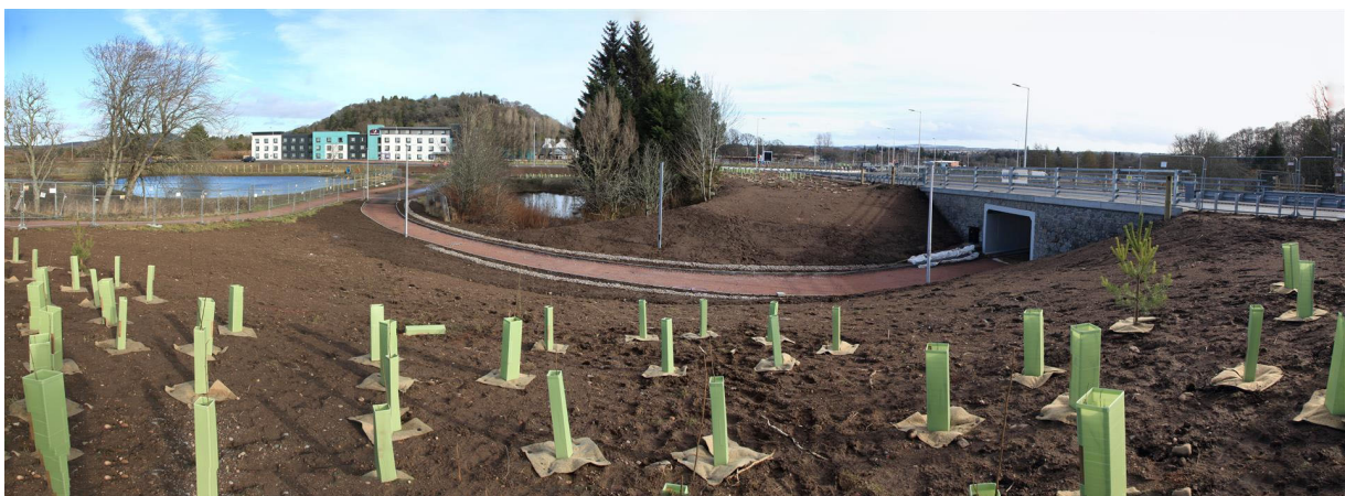
Looking East to the new underpass under the A82 – footpath ready for surfacing and planting progressing

The planned works in March will see the commissioning of the new bridge, surfacing across the site, the installation of the new Variable Message signs and the final landscaping.