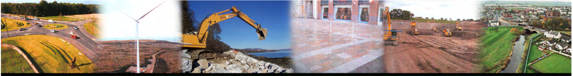
Progress Photos – Shore path reinstated following installation of sewer outfall