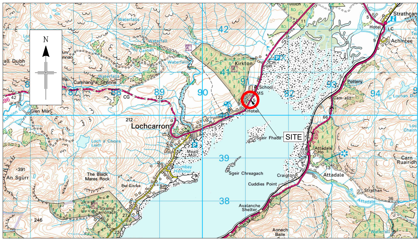
LOCATION PLAN SCALE 1:50,000

T:\001_Design Team 2003_Small_Schemes_Projects\Lochcarron Primary - 2021 Schemes\Lochcarron Primary - YCHMS3049\2 DRAWINGS\CAD\LIVE\LOCHCARRON_LIVE_01.dwg 06/04/2021 ANSI A (8.50 x 11.00 inches)