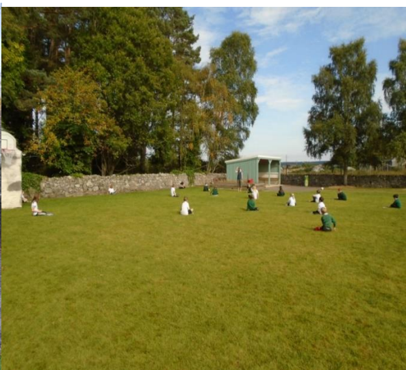
We have a wonderful outdoor space.