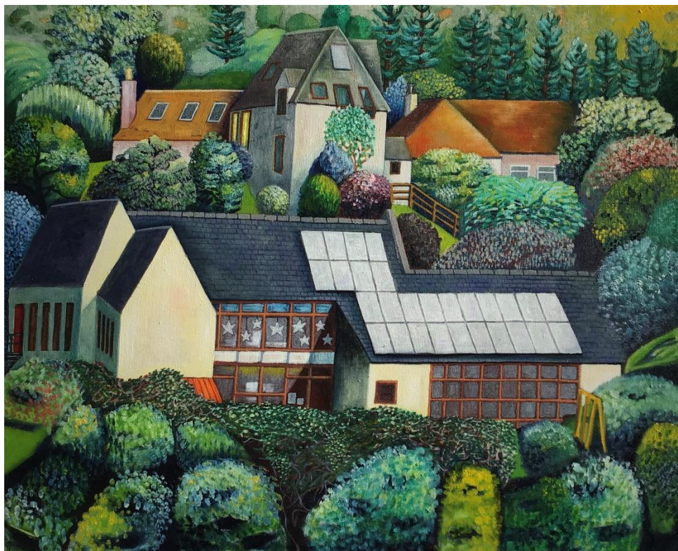
'Learning About Kyle of Lochalsh,' oil on canvas, 6 29/10/2021