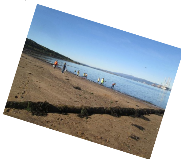
[P1-7 took part in the Big Beach Clean 2019 with support from Cromarty Port Authority]