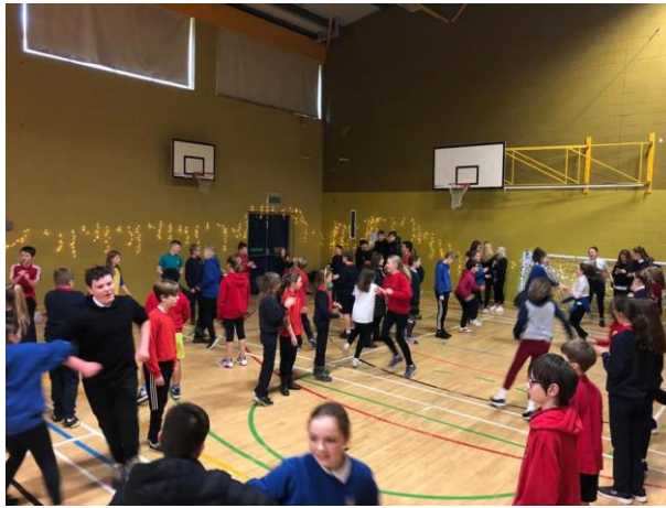
[P7 Transition Ceilidh- December 2019]