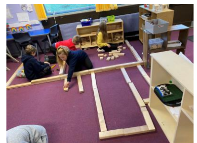
Block Play 2021