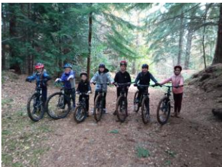
Outdoor Learning at Evanton Community Woods 2021