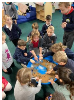
COP26 Learning 2021