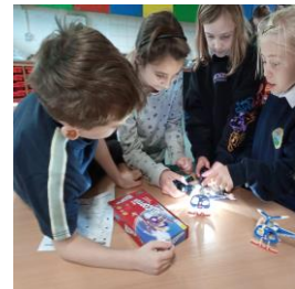
STEM Learning 2021