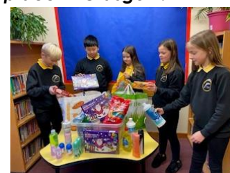
Rights Respecting Schools Food Bank Collection

Our Contexts for learning are really interesting, "I am enjoying learning about the world and history." We've been working hard to become better at maths and