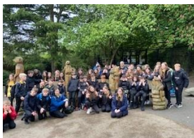
P7 Residential to Edinburgh

Trips are going ahead now. Mostly it's a day trip to help with what we are learning in class but the P7s got to stay away for two nights, and we hope that P6 and P7 can have residential next year. "My learning has been enhanced by learning about the Battle of Killiecrankie and the creation of the universe at Dynamic Earth with all the interactive activities. I learnt about all the WW2 planes and got to see them in firsthand, I got to see the 1/7 in the world Concorde. I got to see lots of nearly extinct animals like penguins and the fierce tigers and lions."