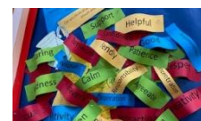
P7 Columba 1400 Leadership Academy

Primary 7 took part in the Columba 1400 Leadership Academy. "We found exploring the values of Perseverance, Awareness, Focus, Integrity, Creativity and Service really interesting."