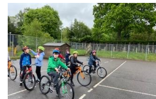
P6 & P7 Bikeability

Clubs are starting up again and there are more things happening in the school. "Bikeability has been fantastic. I feel more confident in riding my bike to school."