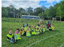
Nursery ready to begin their sponsored walk

We are so happy that school is getting back normal. We don't have zones at breaktimes, and we can sit with people from other classes in the lunch hall. We are also happy that we don't have so much online learning "It's great to be back in the classroom!"