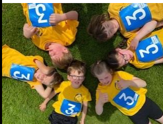
Baillie Cup Competitors

The library is open again "we have lots of books to choose from, I love reading."