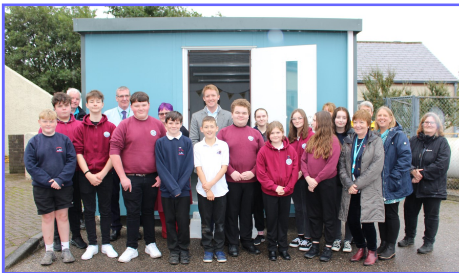
The Duke of Westminster officially opens 'The Big Blue Box', our new youth facility, situated at the rear of the school. October 22