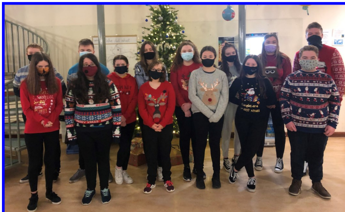
Some of our festive pupils, dressed for Christmas Jumper Day 2020

We have arranged of activities offered by staff at some lunchtimes at different times throughout the school year. These have included music club, singing club, chess, STEM club and Sports club to name but a few.