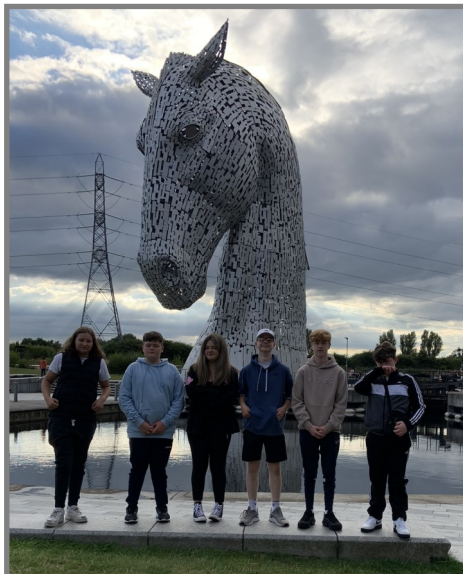
At the Kelpies S1-3 Cultural Trip August 22

http://www.highland.gov.u/info/899/schools - grants and benefits/14/education_maintenance_allowance