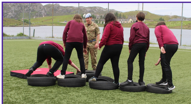
Team Building Skills with the Army June 2021

The school holds regular meetings with other agencies such as educational psychology, social work and health. At these meetings we discuss concerns we have regarding our pupils. Therefore there could be times when a pupil's problem is shared with others out with the school. If the problem is thought to be significant and another agency becomes involved, we will always inform parents. However, if no further action is taken, parents may not always know their child was mentioned.