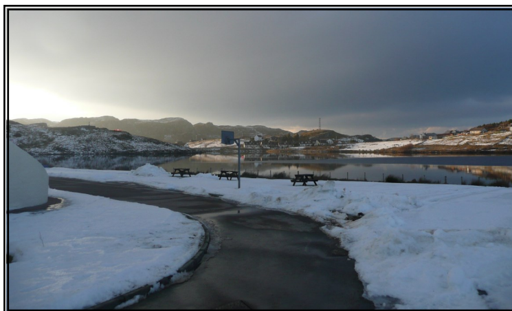
The winter view from the back of the school.

As with Sex Education, Drug awareness is delivered in a similar manner usually working with partner agencies such as NHS and Police Scotland to ensure that information is relevant and up to date.