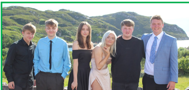
Our Leavers of 2022 At our Annual Leavers' Dinner

http://www.highland.gov.uk/info/886/schools_-_additional_support_needs/1/support_for_learners