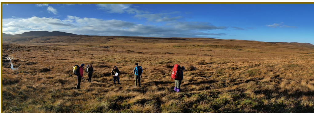
From Source to Sea Some of our S3s on their overnight expedition to Strathan & Sandwood Bay October 22

There are also information sheets available at www.chipplus.org.uk and click on Education.