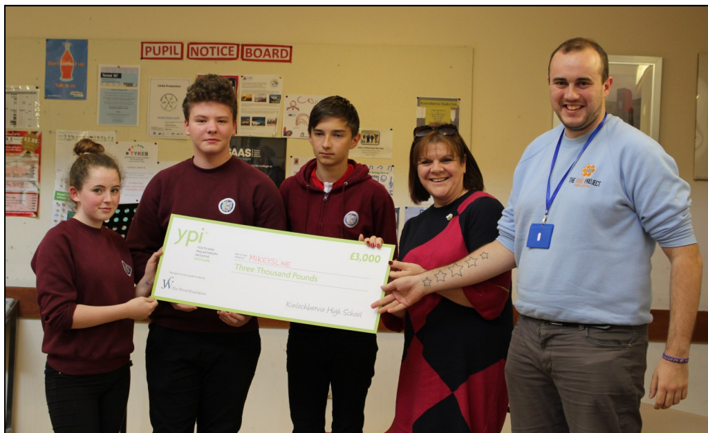
The successful group hand over the YPI cheque to members of Mikey's Line, Kinlochbervie—October 2018

Due to the pandemic we were unable to run this programme in 2020 Or 2021.