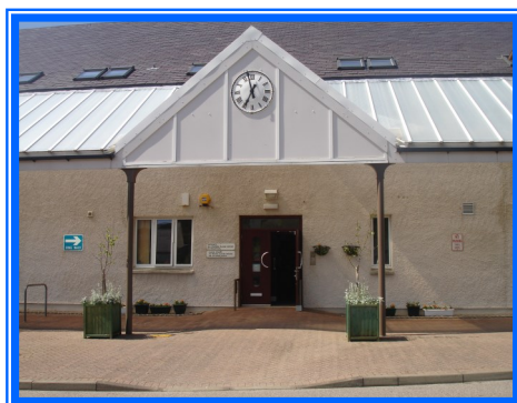
The main entrance.