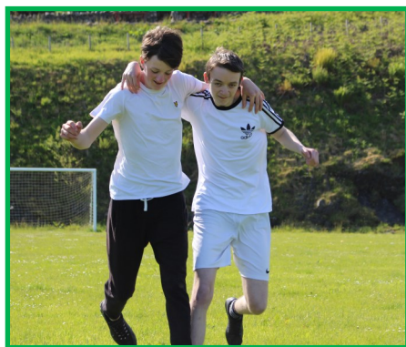
Sports Day Fun June 2022

Parents must send in a note prior to a planned absence so teachers can be informed and attempts made to minimise the inevitable disruption to the pupil's schoolwork. Some planned absences are unavoidable: e.g. hospital appointments, bereavements. However, it is our experience that some planned absences could be avoided: e.g. routine visits to opticians, shopping trips to Inverness, family holidays. All absences have a severe effect on learning and the detrimental consequences must be taken into account before a decision is made to proceed with an avoidable planned absence.