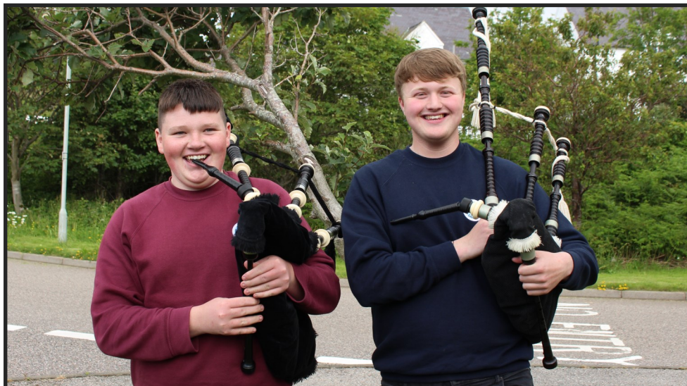
Our young pipers June 22

We have a visiting fiddle tutor and also a visiting chanter and pipes instructor. Before the pandemic we had concerts at Christmas and at the end of our summer term. We have since held virtual concerts in school. We have a music & drama club one lunchtime a week.