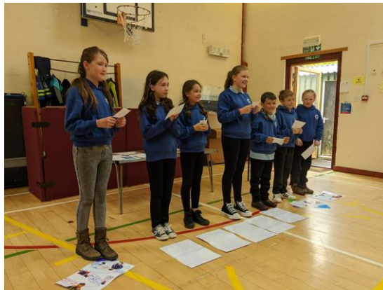
Our pupils play an important role at assembly. They are confident and valued.

www.educationscotland.gov.uk/curriculumforexcellence