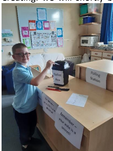
Every August all pupils cast their vote in a secret ballot to Elect new Pupil Council Reps

Creating: we will shortly begin the next stage of building our seating for the outdoor classroom