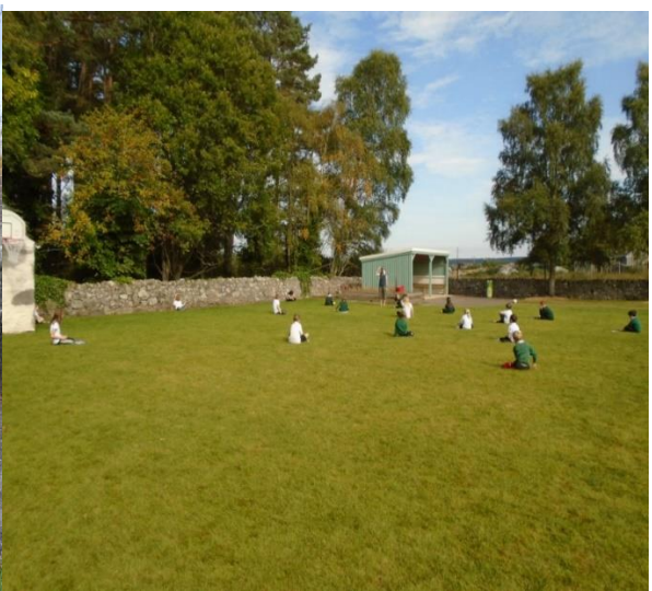
We have a wonderful outdoor space.