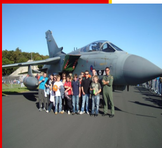
Some of the Secondary Pupils at the RAF Leuchers trip.

As a part of a 3-18 campus, we have close links with the secondary school. Staff share learning experiences and work together on linked projects. Pupils in the upper school are invited to take part in some of the varied social activities of the Secondary, which might include quizzes, sports day or carol services.