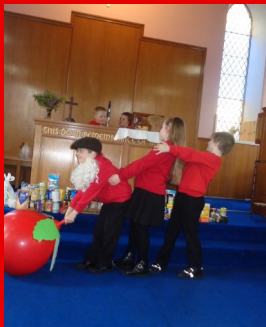
Harvest Festival 2019

We meet each Friday morning for a school assembly and, when it is not Reflection time, we always celebrate our successes. Head teacher awards are given out, staff award certificates for Star Writers or any other certificate the pupils may have been awarded. We also announce the winners of the house points competition. This is an important time for the school to come together as a family and share in each others successes.