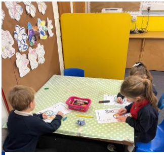
P1/2 Learning our Numbers