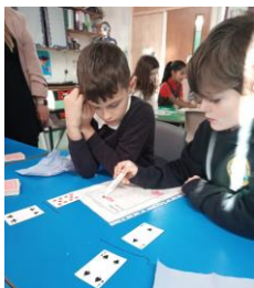
P4/5 Fraction Games