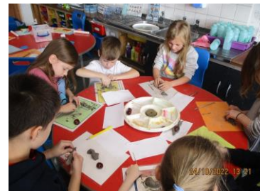
P2/3 Making Clay Snails from Conkers