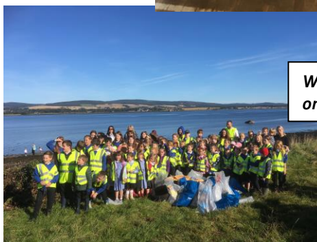
Working with Cromarty Port Authority on our annual beach clean

To this end all Resolis Pupils are part of one of our Citizenship groups: