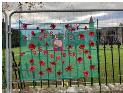
Banner made to commemorate Remembrance Sunday 2022

We involve all pupils as widely as we can in the life of their school and local community.