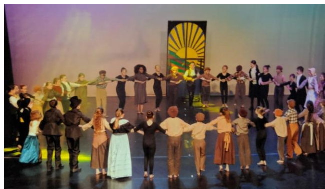
We rock at J Rock

The Expressive Arts are Art and Design, Drama, Music and P.E. Through Expressive Arts the school aims to develop pupils' creative abilities which are very important for a child's all-round development. Through these subjects children can express their feelings and emotions and develop different skills to those offered by other curriculum areas. They will also learn to appreciate their own work, that of others and of experts. Specialist teachers are used to help to teach some of these subjects.