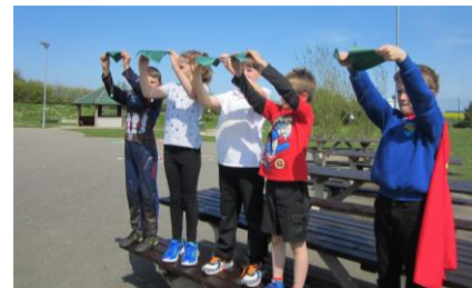
Testing our parachutes

We aim to use the local area and people within it as much as possible to emphasise the importance of learning about our own and other communities. It also gives lots of opportunities for pupils to see the kinds of careers available within and outwith the Black Isle so helping them to recognise the importance of education to their futures.