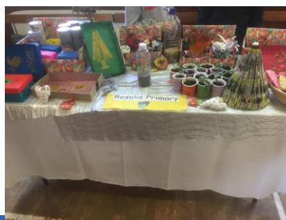
Our stall at the Resolis Hall Community Craft Fair