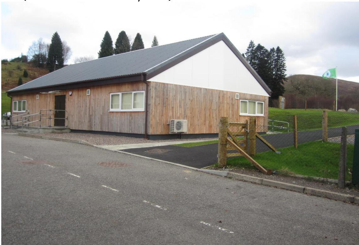
Two further classrooms are located in a new building beside the school.