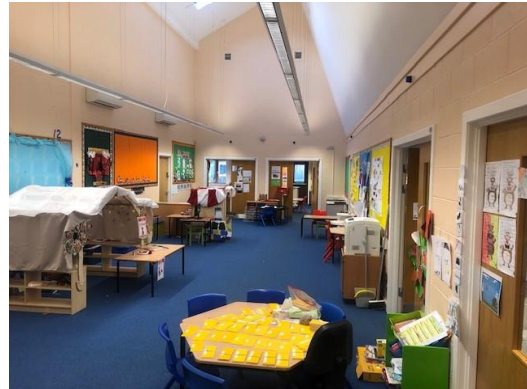
(GP Room and ASN Base) ( Central area - Discovery Zone )