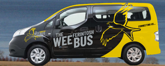
Electric Vehicle wheelchair accessible

Service available in the Ferintosh Community Council area, Monday to Friday, between the hours of: 09.30 to 16.00 (Community use outwith these hours - See Leaflet)