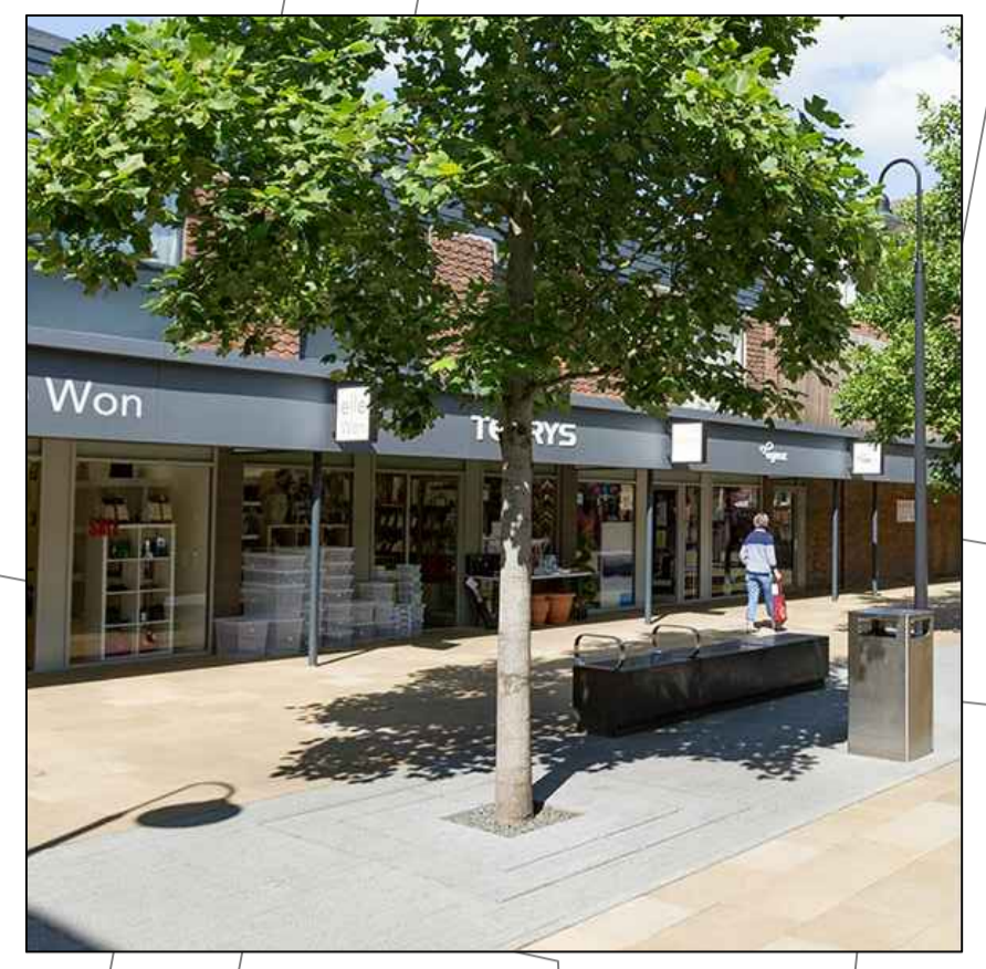
Ref. 2: Contrasting paving design example integrating street furniture, such as benches, trees, bicycle stands etc., into new shared public space