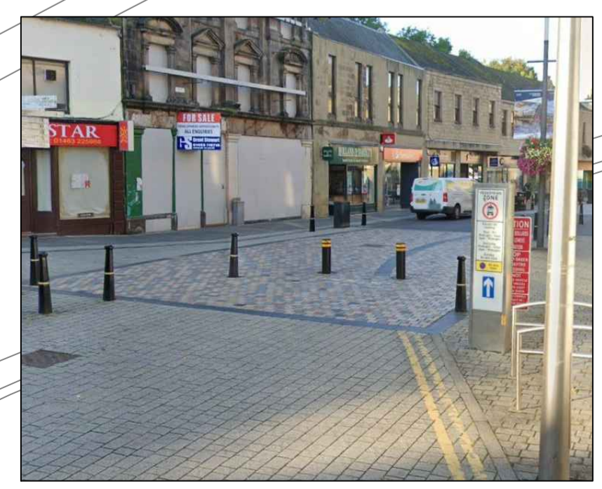
Ref. 7: Automatic rising bollards example used in Inverness High Street.