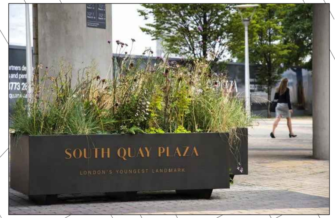
Ref. 5: Examples of planters inscribed with text