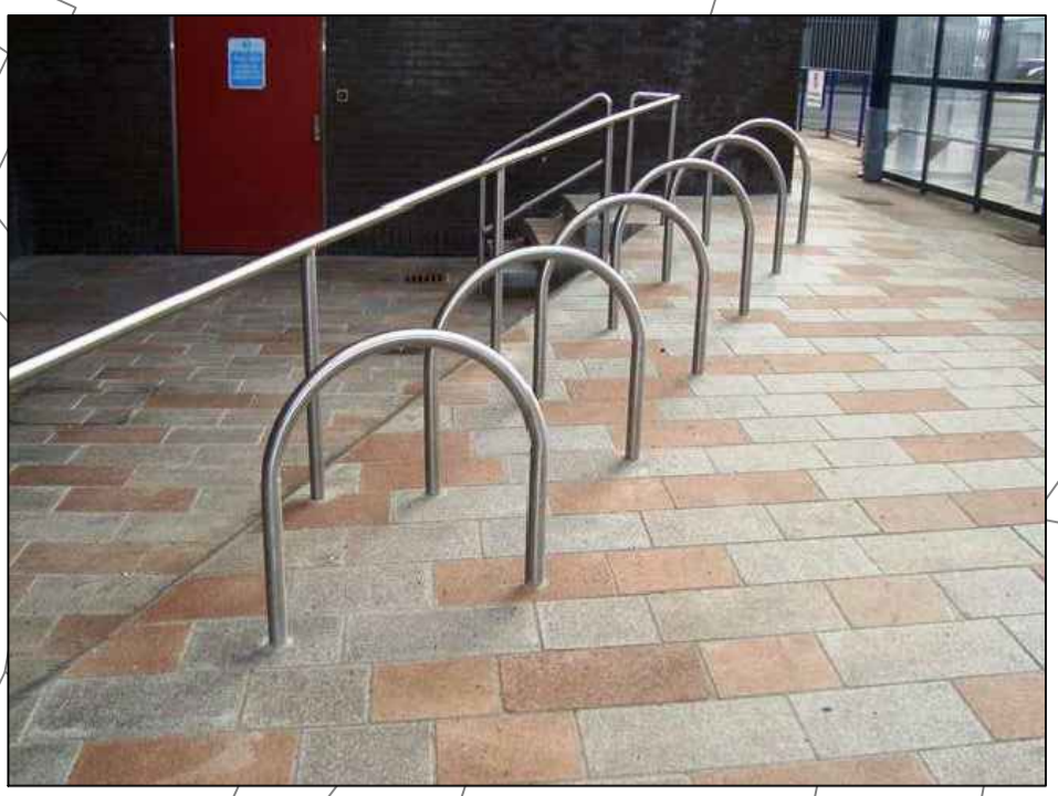
Ref. 1: Examples of bicycle stands