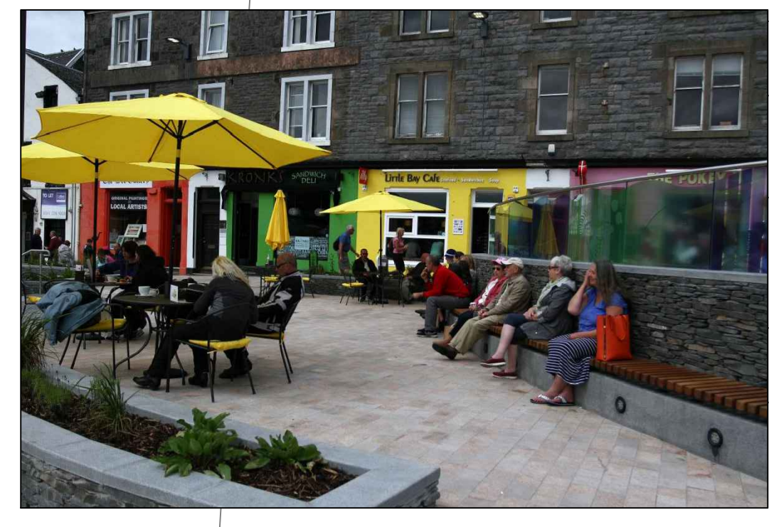
Ref. 4: Examples of planters with built-in seating