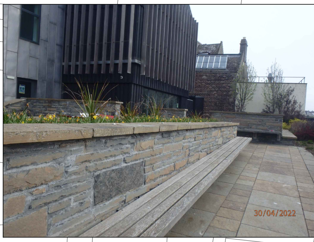
Ref. 3: Caithness flagstone planters with built-in bench seating